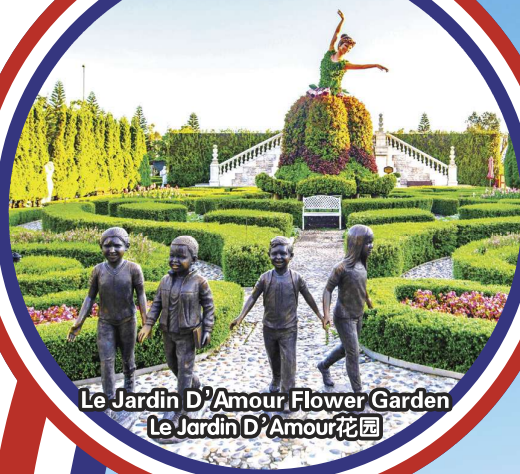
Le Jardin D'Amour Flower Garden Le Jardin D'Amour 花园