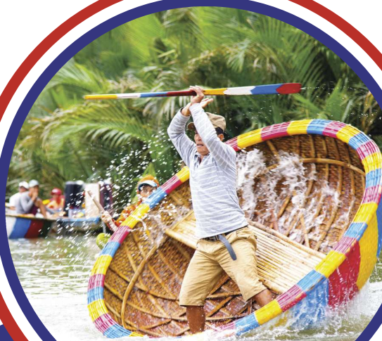
Cam Thanh Coconut Village Cam Thanh 椰子村