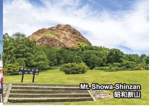
Mt. Showa-Shinzan 昭和新山