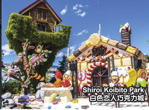
Shiroy Koibito Park 白色恋人巧克力城