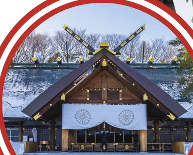
Hokkaido Shrine 北海道神宫