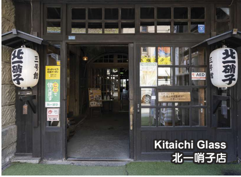
Kitaichi Glass 北一硝子店