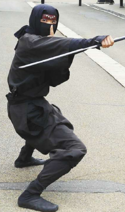
Date Jidaimura 伊达时代村

行程次序，以當地旅社安排為準。 Sequences of Itinerary are subject to local arrangement.