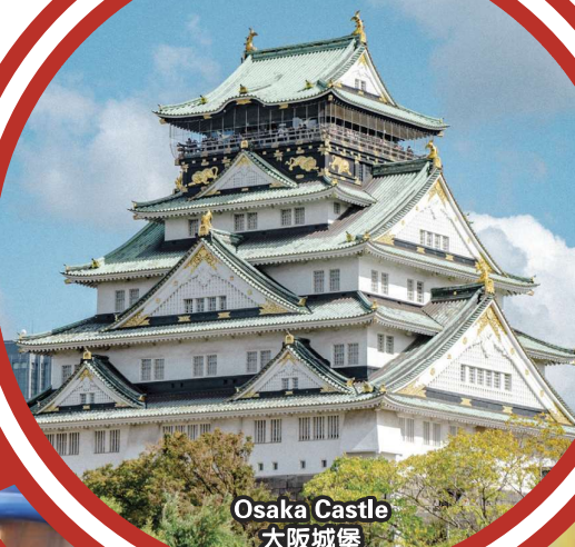
Osaka Castle 大阪城堡