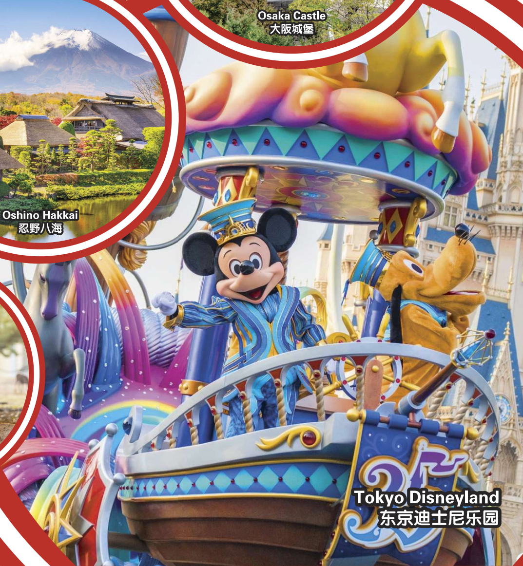
Tokyo Disneyland 东京迪士尼乐园

行程次序，以當地旅社安排為準。 Sequences of Itinerary are subject to local arrangement.