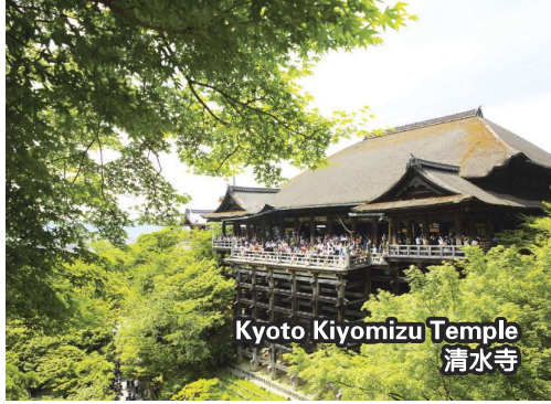
Kyoto Kiyomizu Temple 清水寺