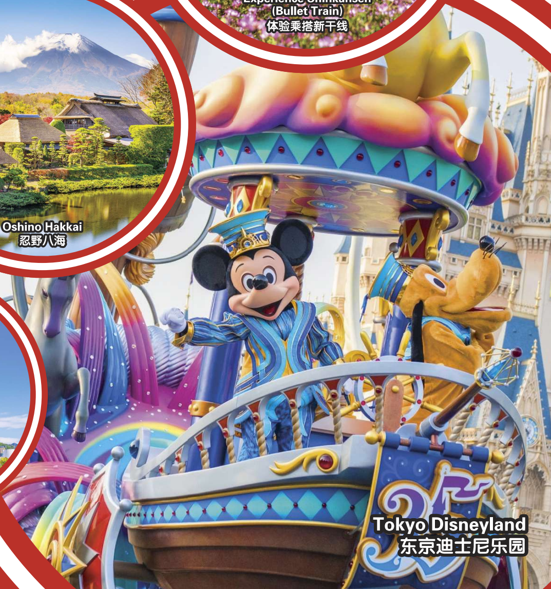
Tokyo Disneyland 东京迪士尼乐园

行程次序，以当地旅社安排为准。 Sequences of Itinerary are subject to local arrangement.