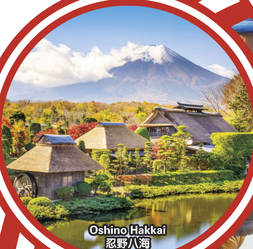
Oshino Hakkai 忍野八海