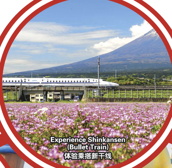
Experience Shinkansen (Bullet Train) 体验乘坐新干线