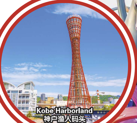
Kobe Harborland 神户渔人码头