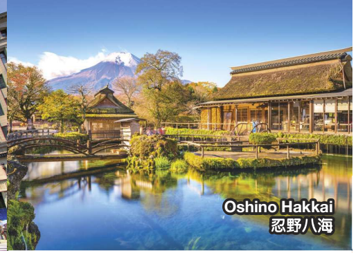
Oshino Hakkai 忍野八海