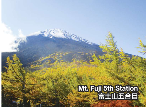
Mt. Fuji 5th Station 富士山五合目