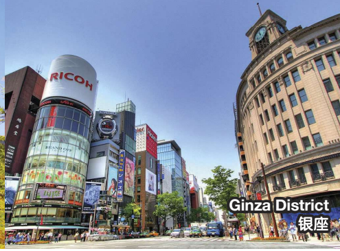
Ginza District 銀座