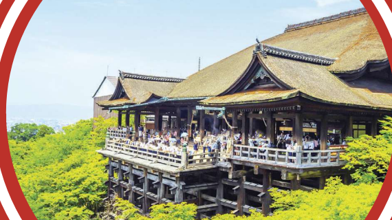
Kyoto Kiyomizu Temple 京都清水寺