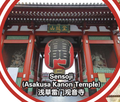
Sensoji (Asakusa Kannon Temple) 浅草雷门观音寺