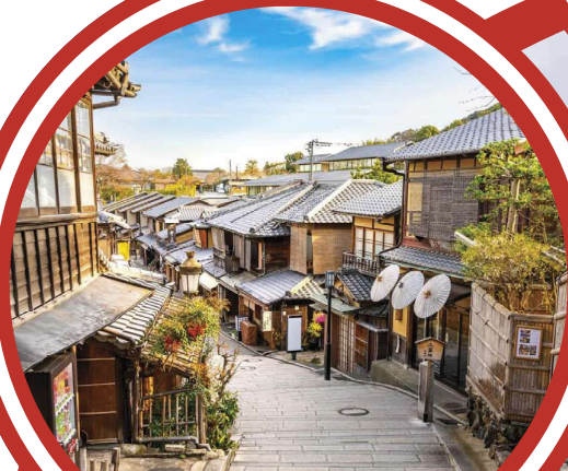
Ninenzaka and Sannenzaka 三年坂・三年坂