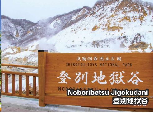
Noboribetsu Jigokudani 登別地獄谷