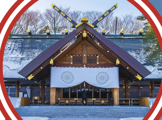
Hokkaido Shrine 北海道神宫