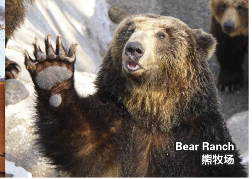
Bear Ranch 熊牧场