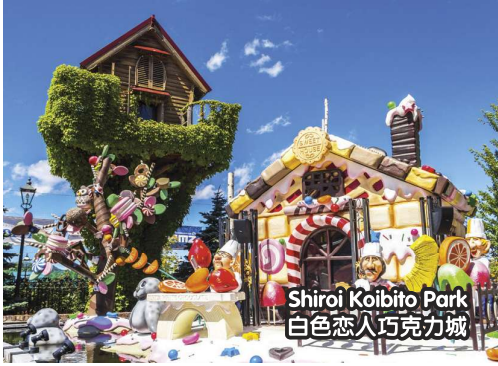
Shiroi Koibito Park 白色恋人巧克力城