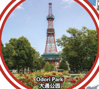
Odori Park 大通公园