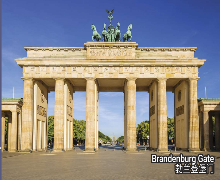
Brandenburg Gate 勃兰登堡门