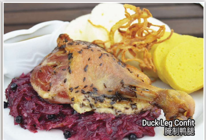
Duck Leg Confit 腌制鸭腿