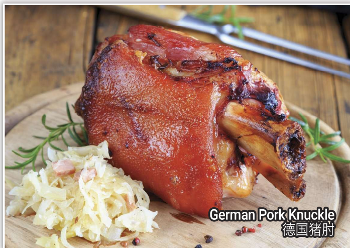
German Pork Knuckle 德国猪肘