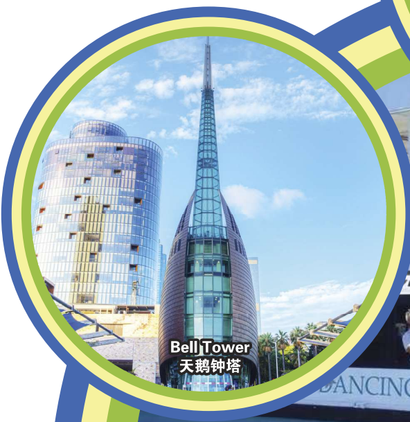
Bell Tower 天鹅钟塔