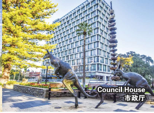
Council House 市政厅