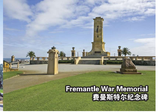
Fremantle War Memorial 费曼斯特尔纪念碑