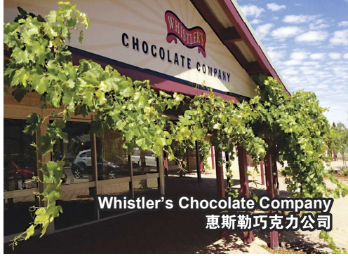
Whistler's Chocolate Company 惠斯勒巧克力公司