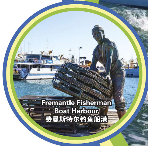
Fremantle Fisherman Boat Harbour 费曼斯特尔钓鱼船港