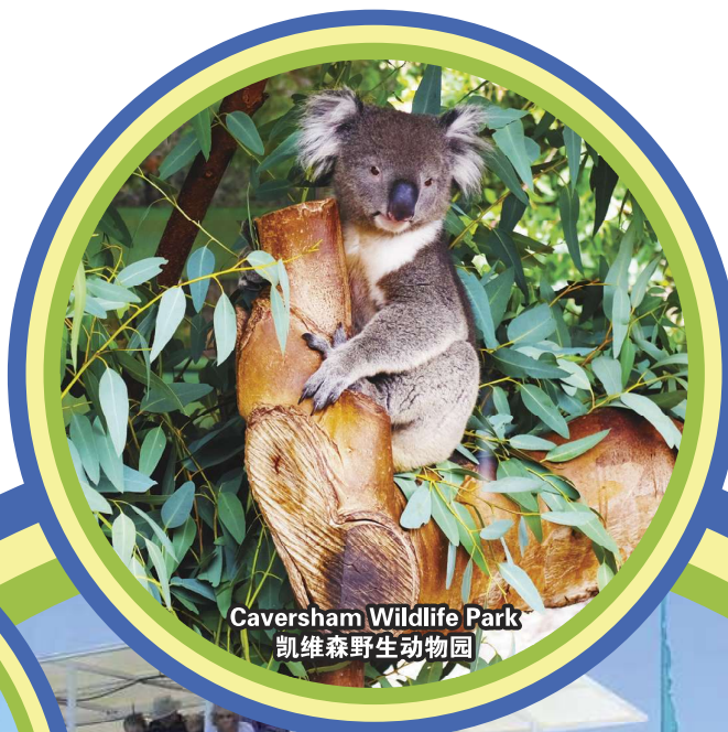
Caversham Wildlife Park 凯维森野生动物园