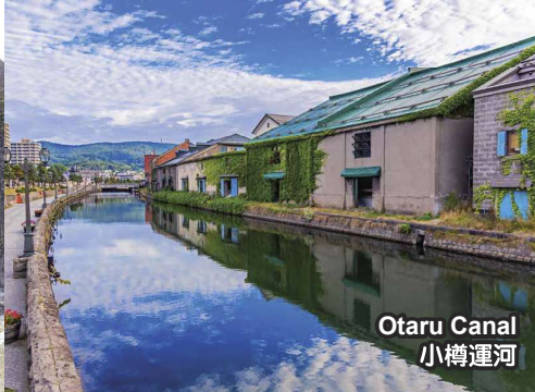
Otaru Canal 小樽運河