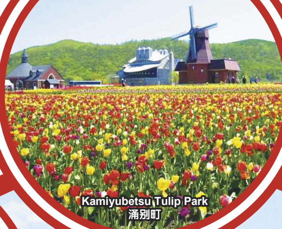
Kamiyubetsu Tulip Park 涌別町