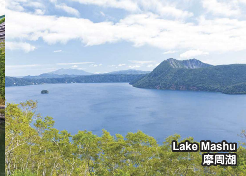
Lake Mashu 摩周湖