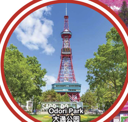
Odori Park 大通公園