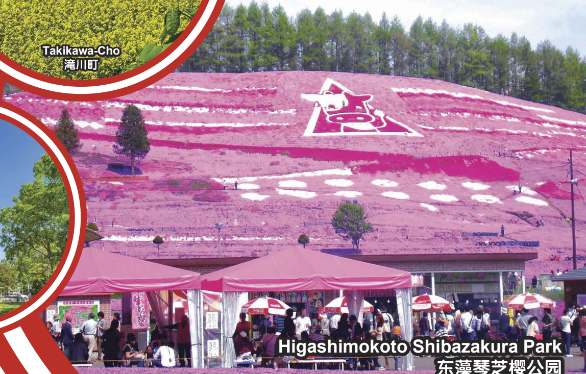
Higashimokoto Shibazakura Park 东藻琴芝桜公园

行程次序，以當地旅社安排為準。 Sequences of Itinerary are subject to local arrangement.