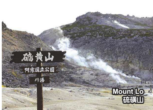
Mount Lo 硫磺山