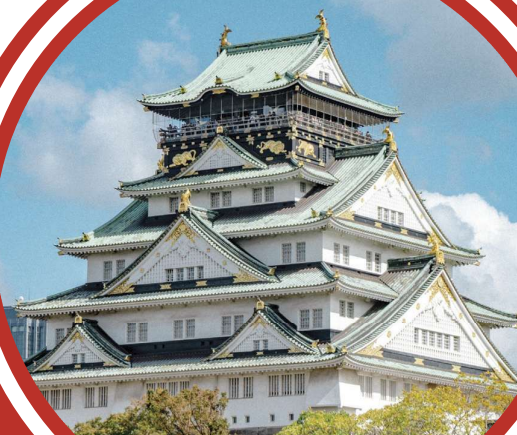
Osaka Castle 大阪城堡