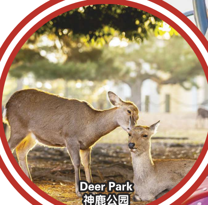
Deer Park 神鹿公园