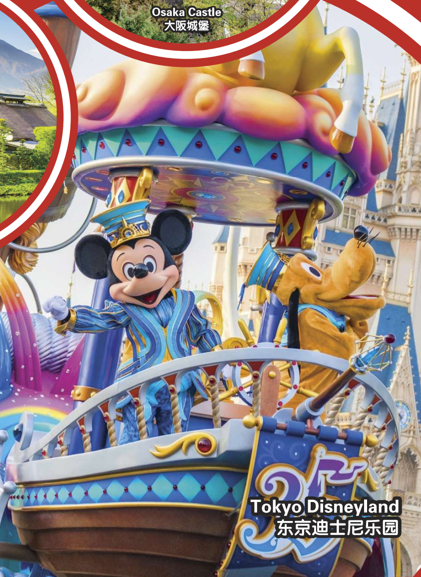
Tokyo Disneyland 东京迪士尼乐园

行程次序，以当地旅社安排为准。 Sequences of Itinerary are subject to local arrangement.