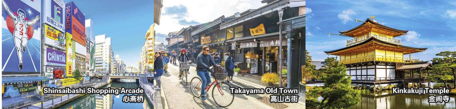
Shinsaibashi Shopping Arcade 心斎橋