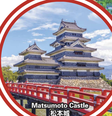
Matsumoto Castle 松本城