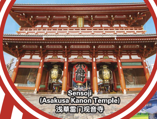
Sensoji (Asakusa Kannon Temple) 浅草雷门观音寺