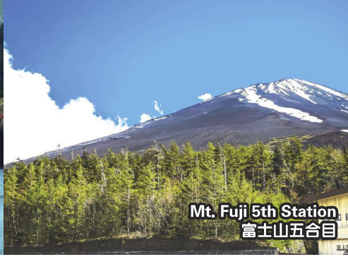
Mt. Fuji 5th Station 富士山五合目