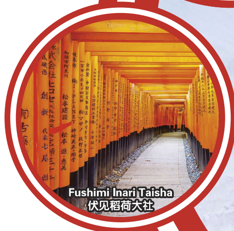
Fushimi Inari Taisha 伏见稻荷大社