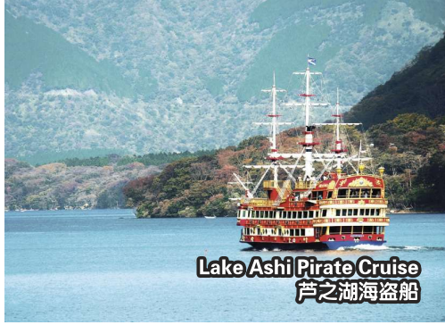
Lake Ashi Pirate Cruise 芦之湖海盗船