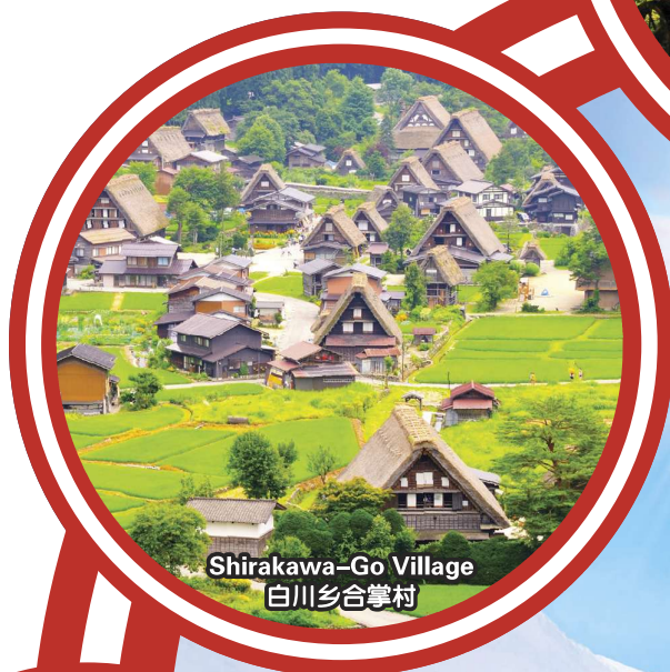
Shirakawa-Go Village 白川乡合掌村