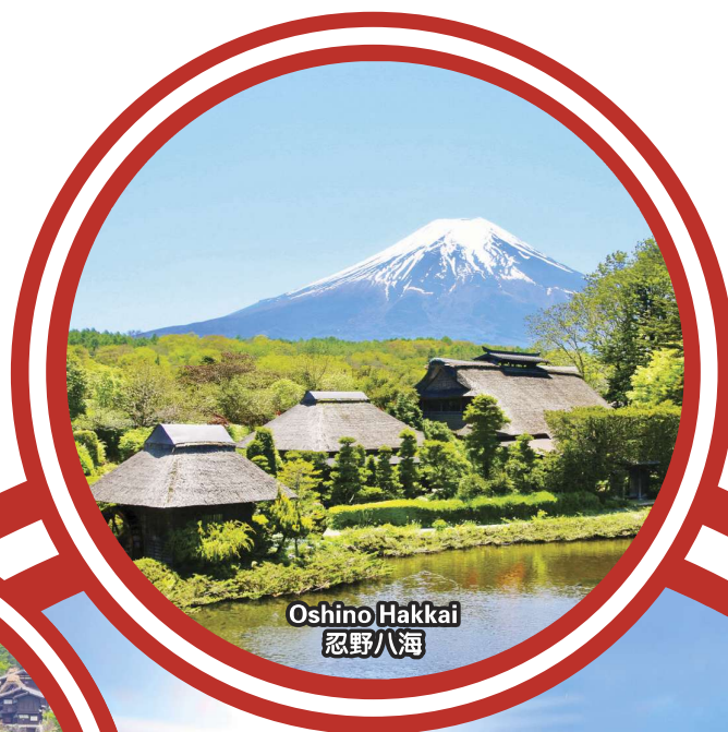
Oshino Hakkai 忍野八海