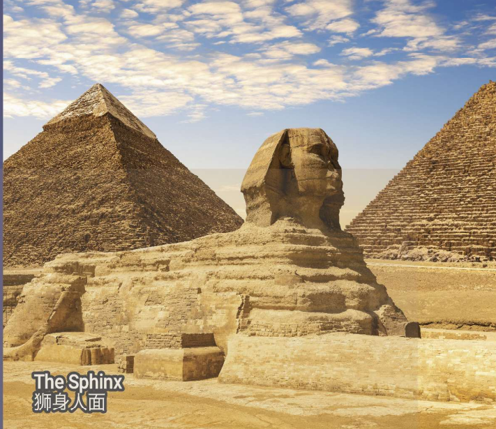
The Sphinx 狮身人面