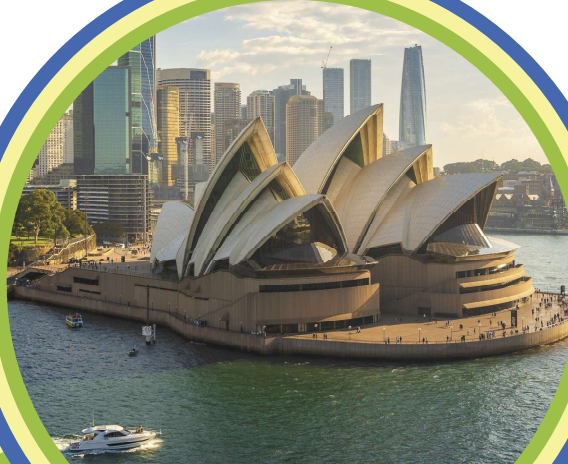
Sydney Opera House 悉尼歌剧院