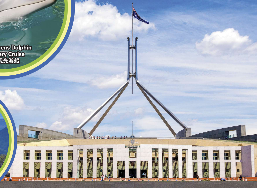
Australian Parliament House 澳洲国会大厦