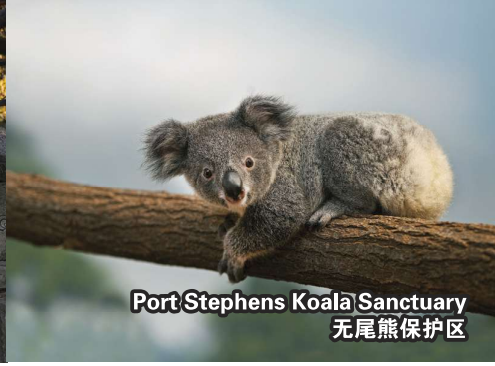
Port Stephens Koala Sanctuary 无尾熊保护区