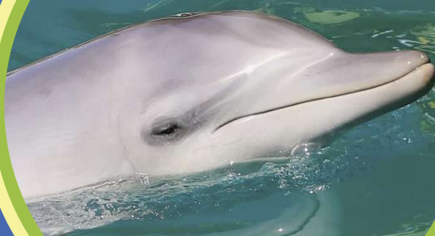
Port Stephens Dolphin Discovery Cruise 海豚观光游船