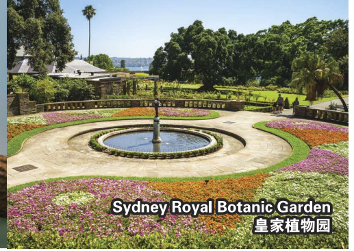
Sydney Royal Botanic Garden 皇家植物园