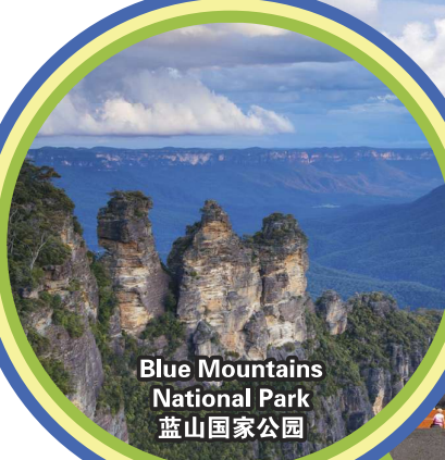
Blue Mountains National Park 蓝山国家公园