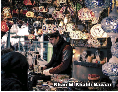
Khan El Khalili Bazaar