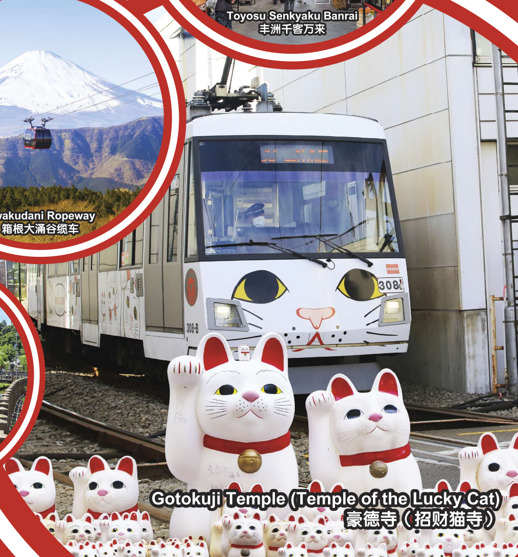
Gotokuji Temple (Temple of the Lucky Cat) 豪德寺 (招财猫寺)

行程次序，以当地旅社安排为准。 Sequences of Itinerary are subject to local arrangement.