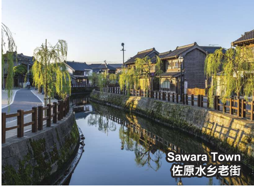
Sawara Town 佐原水乡老街