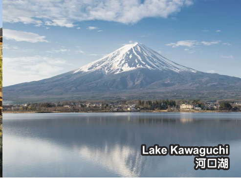
Lake Kawaguchi 河口湖