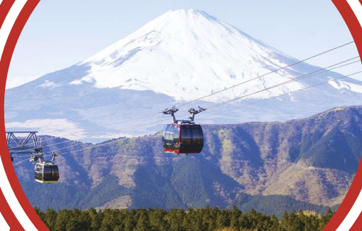
Owakudani Ropeway 箱根大涌谷缆车