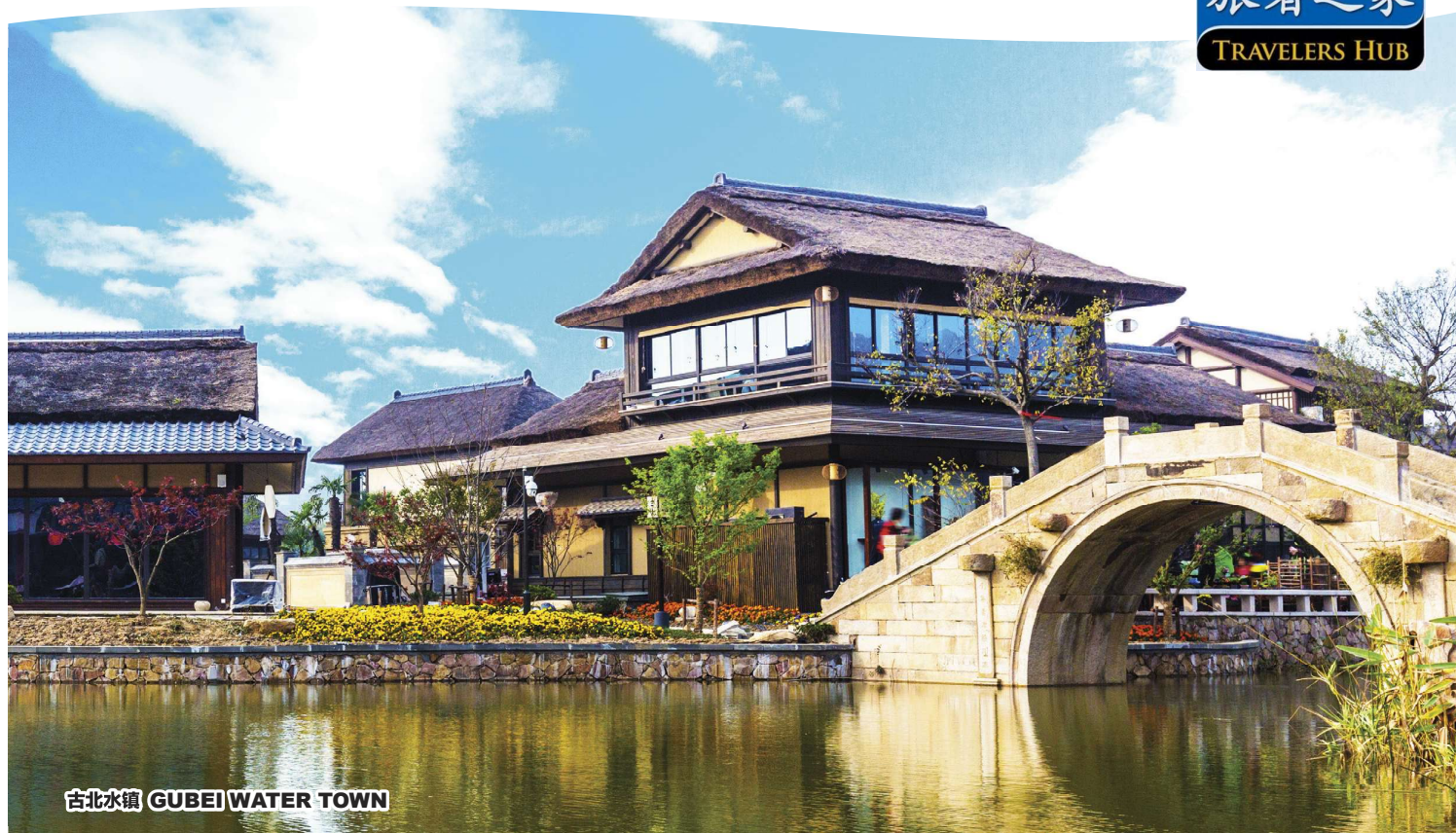
古北水镇 GUBEI WATER TOWN