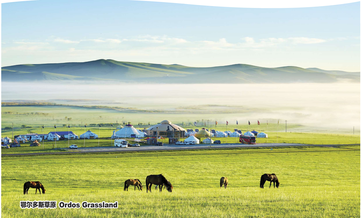
鄂尔多斯草原 Ordos Grassland