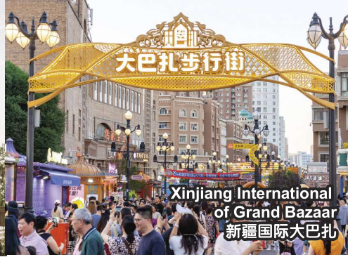
Xinjiang International of Grand Bazaar 新疆国际大巴扎