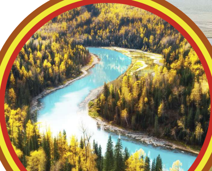
Kanas Scenic Area 喀纳斯景区