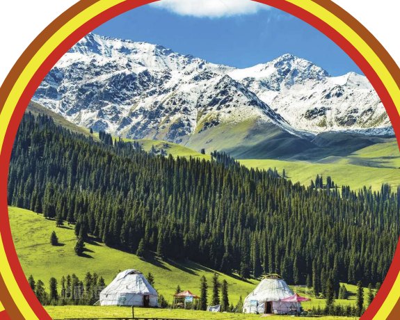
Nalati Grassland 那拉提草原