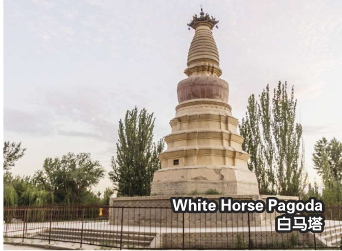
White Horse Pagoda 白马塔