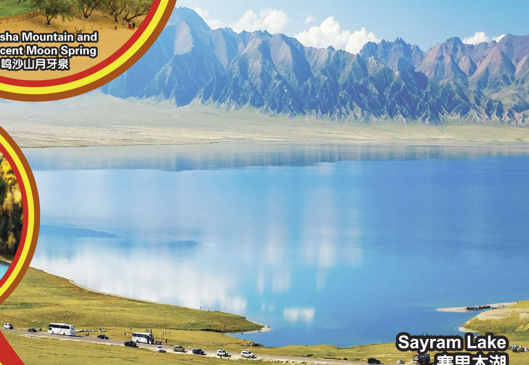
Sayram Lake 赛里木湖

行程次序，以当地旅社安排为准。 Sequences of Itinerary are subject to local arrangement.