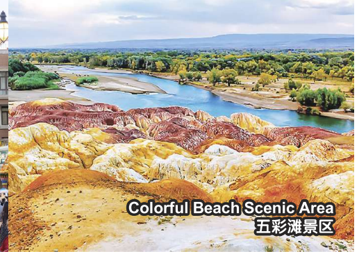
Colorful Beach Scenic Area 五彩滩景区