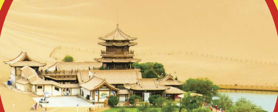
Mingsha Mountain and Crescent Moon Spring 鸣沙山月牙泉