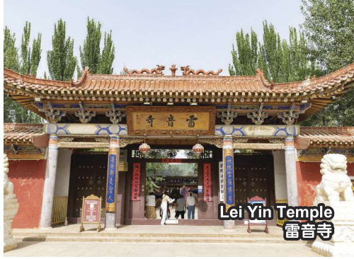
Lei Yin Temple 雷音寺