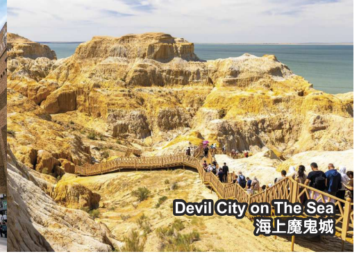
Devil City on The Sea 海上魔鬼城