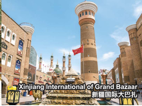
Xinjiang International of Grand Bazaar 新疆国际大巴扎