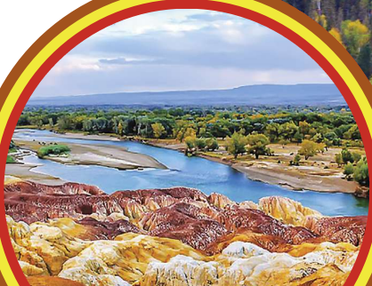
Rainbow Beach Scenic Area 五彩滩景区