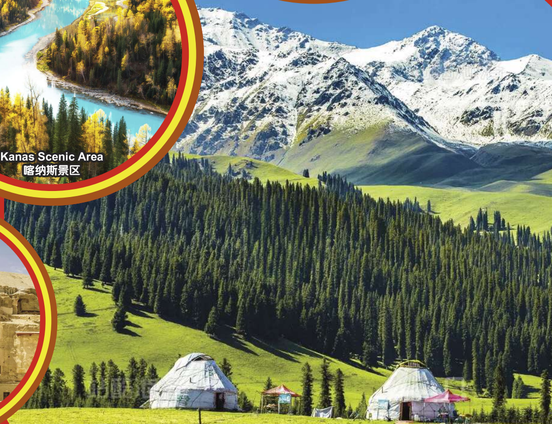
Nalati Grassland 那拉提草原

行程次序，以当地旅社安排为准。 Sequences of Itinerary are subject to local arrangement.