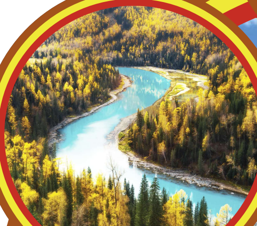
Kanas Scenic Area 喀纳斯景区