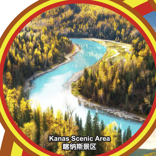
Kanas Scenic Area 喀纳斯景区