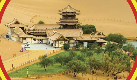
Mingsha Mountain and Crescent Moon Spring 鸣沙山月牙泉