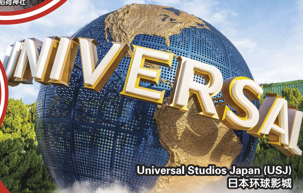
Universal Studios Japan (USJ) 日本环球影城

行程次序，以當地旅社安排為準。 Sequences of Itinerary are subject to local arrangement.