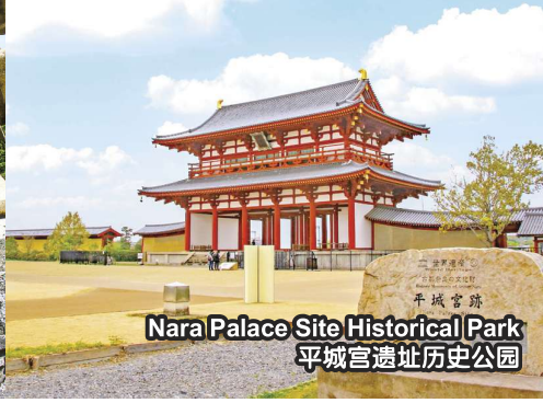
Nara Palace Site Historical Park 平城宮遺址历史公园