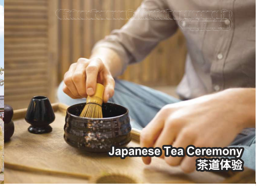
Japanese Tea Ceremony 茶道体验