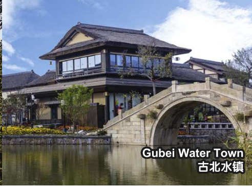
Gubei Water Town 古北水镇