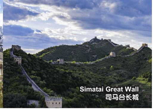
Simatai Great Wall 司马台长城