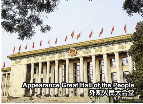
Appearance Great Hall of the People 外观人民大会堂