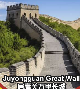
Juyongguan Great Wall 居庸关万里长城