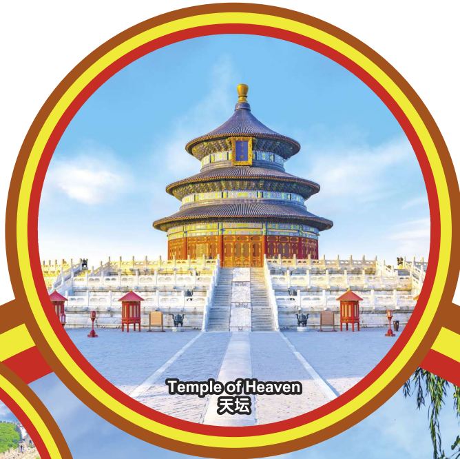
Temple of Heaven 天坛