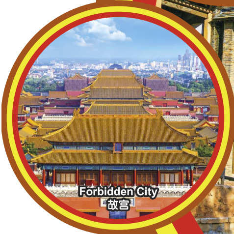
Forbidden City 故宫