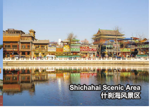
Shichahai Scenic Area 什刹海风景区