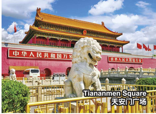
Tiananmen Square 天安门广场