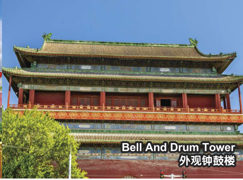
Bell And Drum Tower 外观钟鼓楼