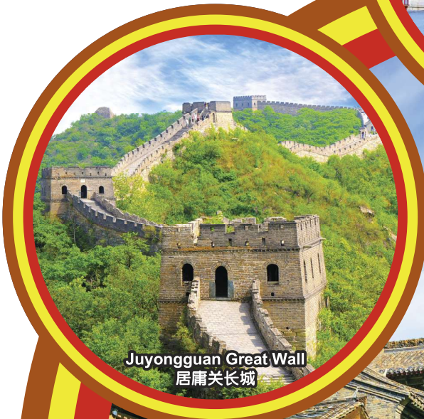
Juyongguan Great Wall 居庸关长城