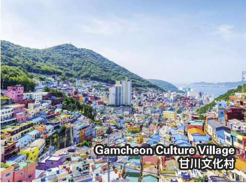
Gamcheon Culture Village 甘川文化村