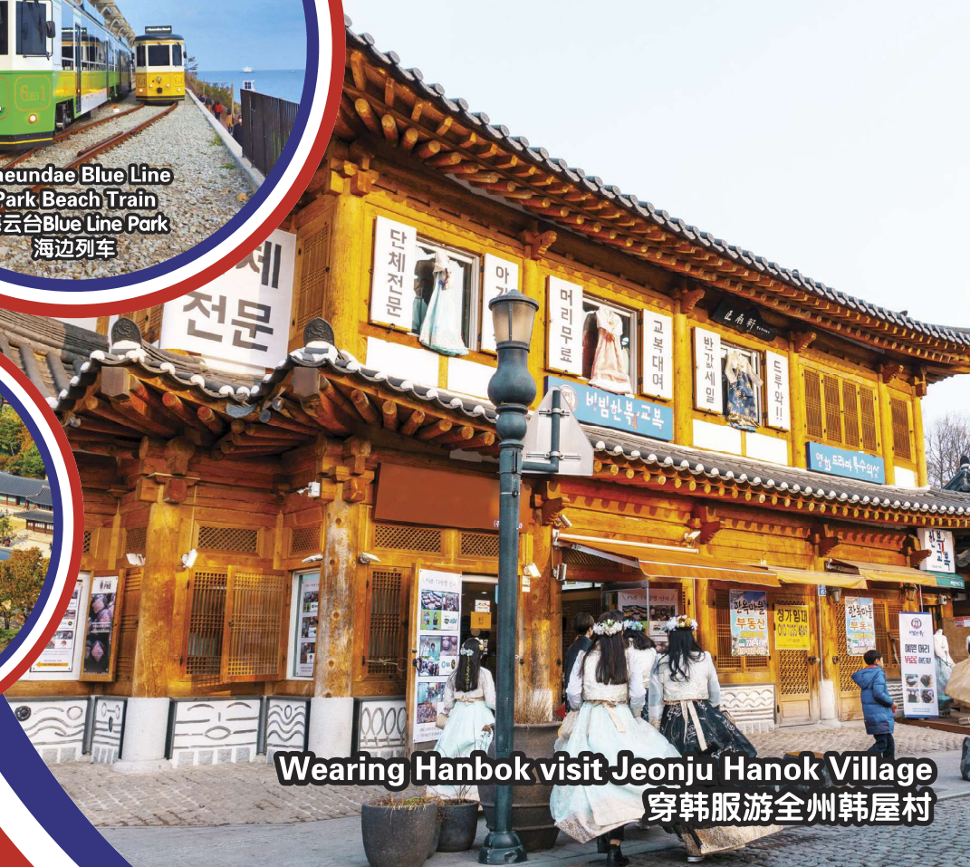
Wearing Hanbok visit Jeonju Hanok Village 穿韩服游全州韩屋村

行程次序，以当地旅社安排为准。 Sequences of Itinerary are subject to local arrangement.