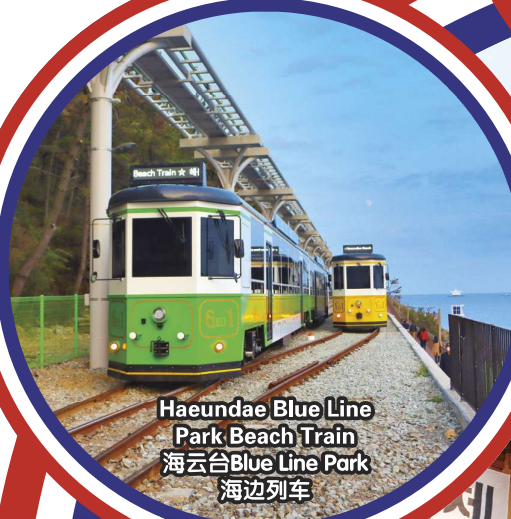
Haeundae Blue Line Park Beach Train 海云台Blue Line Park 海边列车