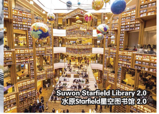
Suwon Starfield Library 2.0 水原Starfield星空图书馆 2.0

*Picture shown are for illustration purpose only *图片仅供参考