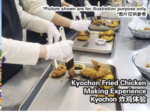
Kyochon Fried Chicken Making Experience Kyochon 炸鸡体验