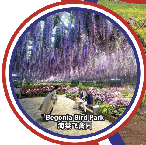
Begonia Bird Park 海棠飞禽园