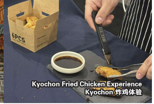
Kyochon Fried Chicken Experience Kyochon 炸鸡体验