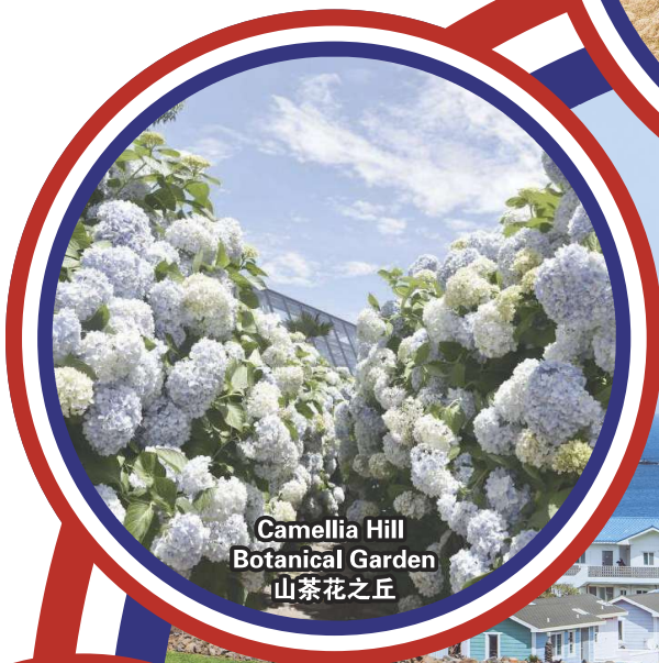
Camellia Hill Botanical Garden 山茶花之丘