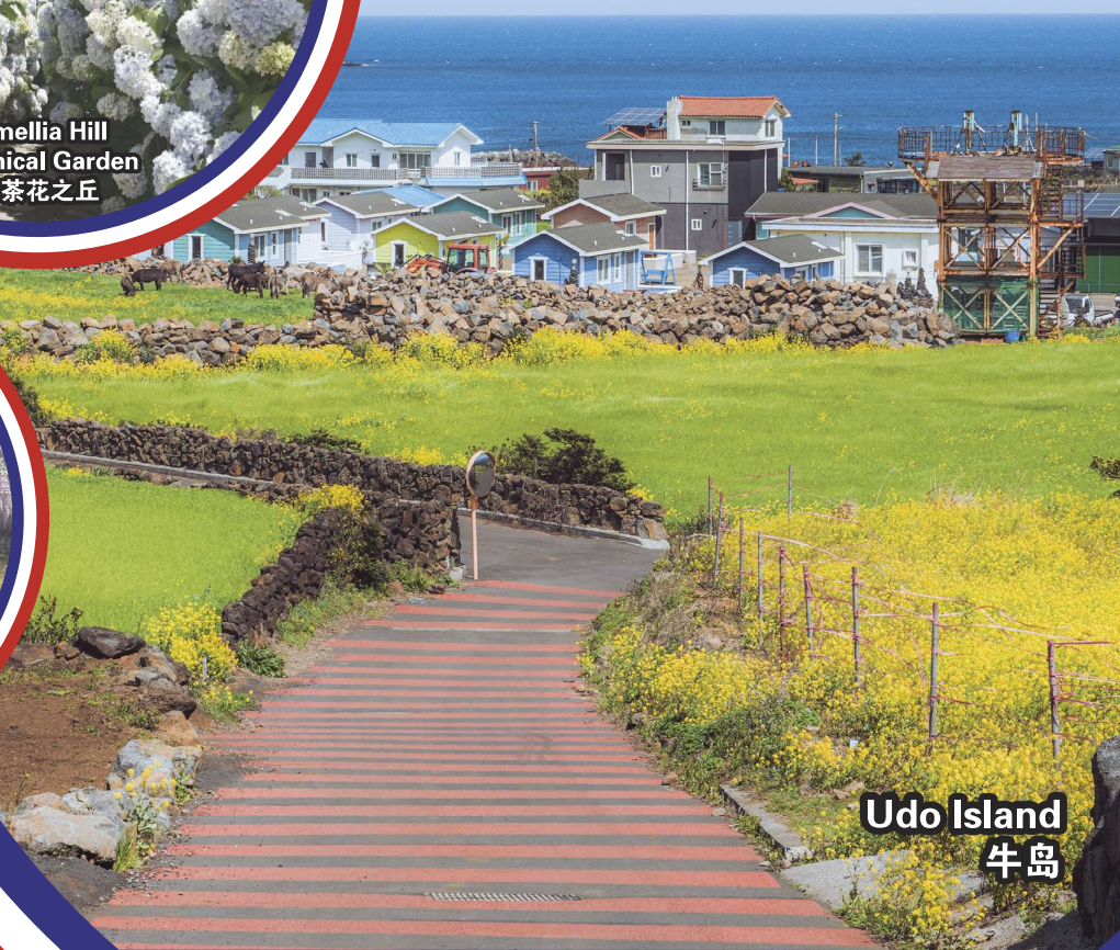
Udo Island 牛岛

行程次序，以当地旅社安排为准。 Sequences of Itinerary are subject to local arrangement.