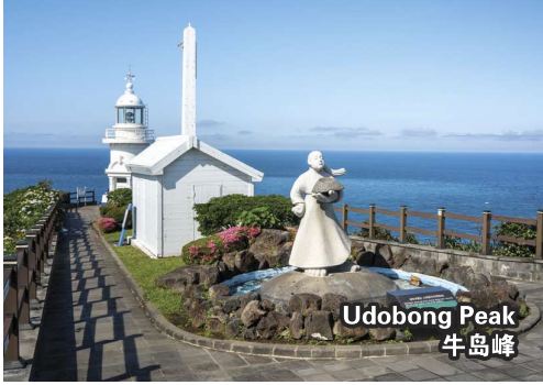
Udobong Peak 牛岛峰