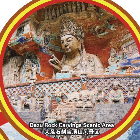
Dazu Rock Carvings Scenic Area 大足石刻宝顶山风景区