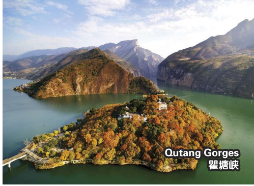
Outang Gorges 瞿塘峡