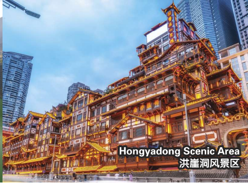
Hongyadong Scenic Area 洪崖洞风景区