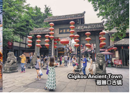
Ciqikou Ancient Town 磁器口古镇