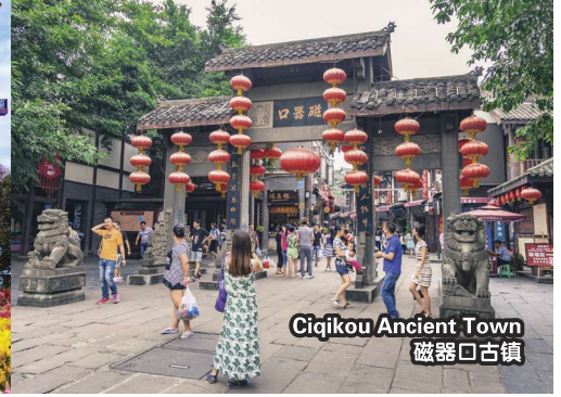
Ciqikou Ancient Town 磁器口古镇