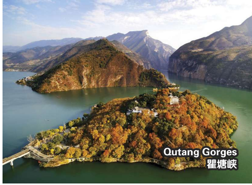
Outang Gorges 瞿塘峡