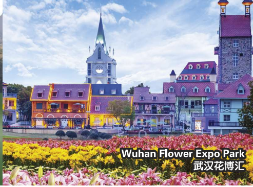
Wuhan Flower Expo Park 武汉花博汇