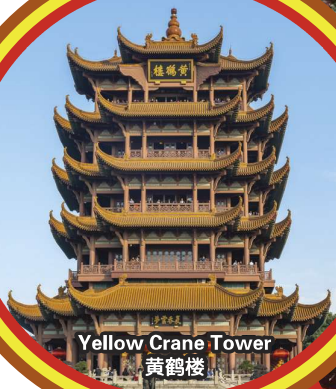
Yellow Crane Tower 黄鹤楼