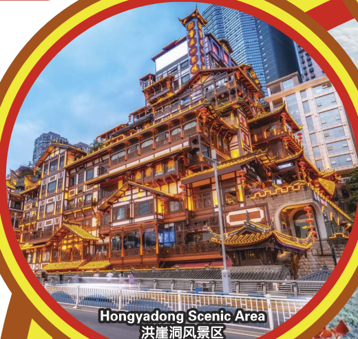
Hongyadong Scenic Area 洪崖洞风景区