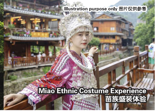
Miao Ethnic Costume Experience 苗族盛装体验