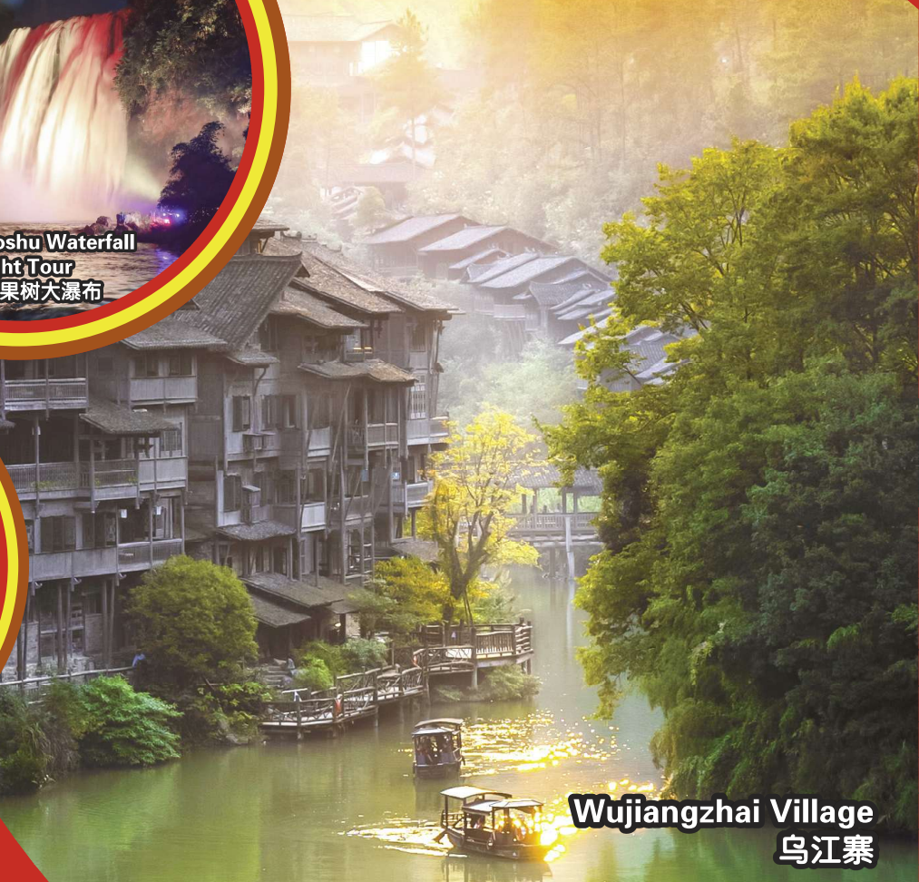
Wujiangzhai Village 乌江寨