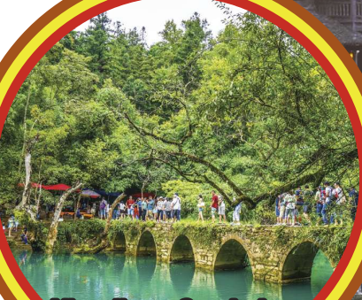
Xiaoqikong Scenic Area 小七孔景区