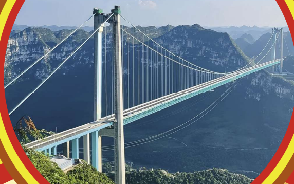
Huajiang Canyon Bridge 花江峡谷大桥