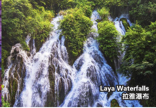
Laya Waterfalls 拉雅瀑布