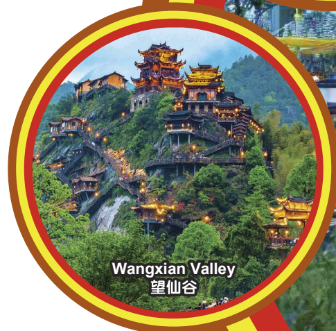
Wangxian Valley 望仙谷