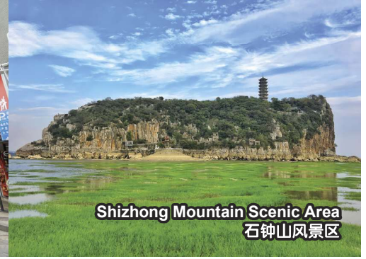
Shizhong Mountain Scenic Area 石钟山风景区