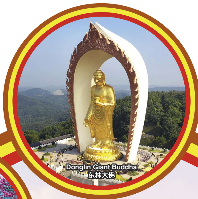
Donglin Giant Buddha 东林大佛