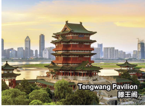
Tengwang Pavilion 滕王阁