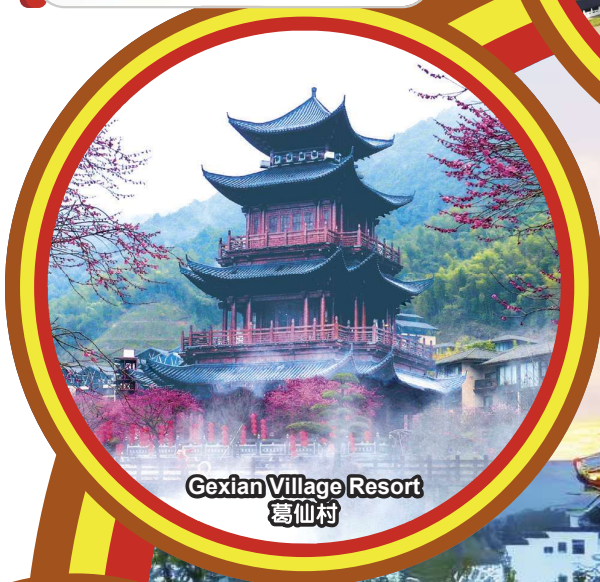
Gexian Village Resort 葛仙村