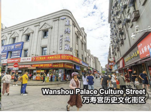
Wanshou Palace Culture Street 万寿宫历史文化街区