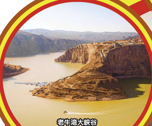
老牛湾大峡谷 Laoniawan Yellow River Grand Canyon