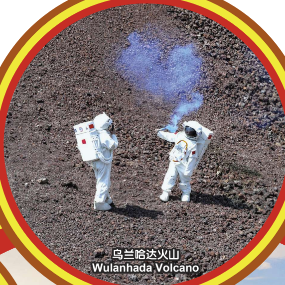
乌兰哈达火山 Wulanhada Volcano