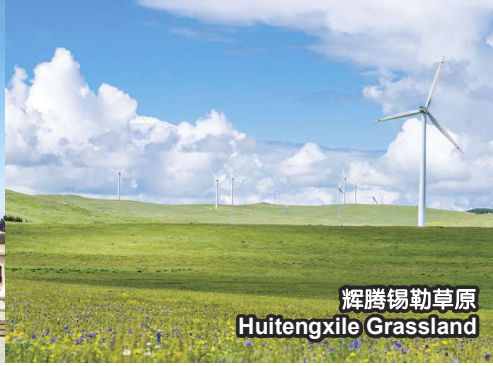
辉腾锡勒草原 Huitengxile Grassland