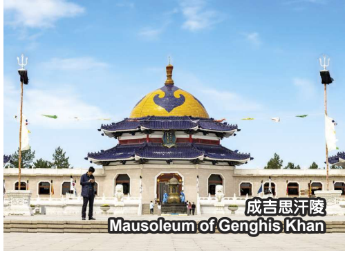
成吉思汗陵 Mausoleum of Genghis Khan