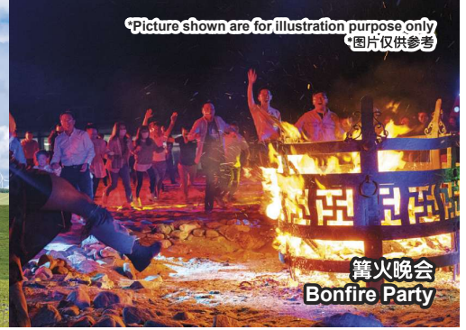
篝火晚会 Bonfire Party

*Picture shown are for illustration purpose only *图片仅供参考