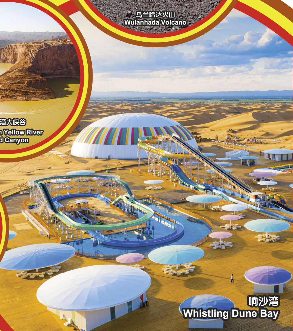
响沙湾 Whistling Dune Bay

行程次序，以当地旅社安排为准。 Sequences of Itinerary are subject to local arrangement.