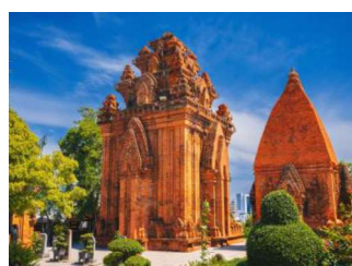
婆那加占婆塔 Po Nagar Temple