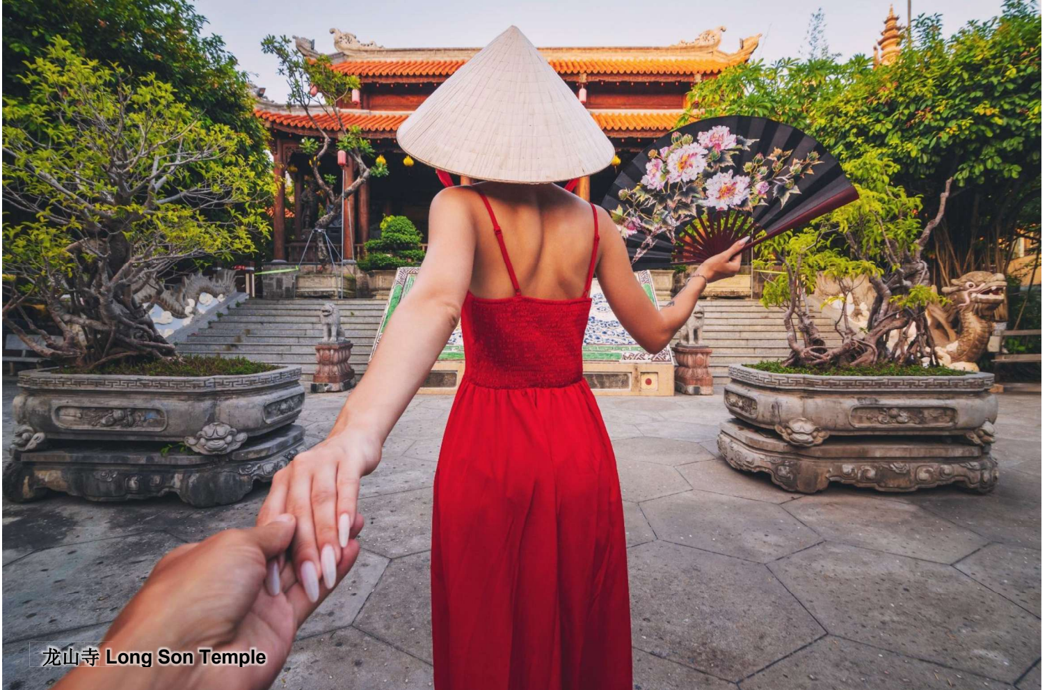
龙山寺 Long Son Temple