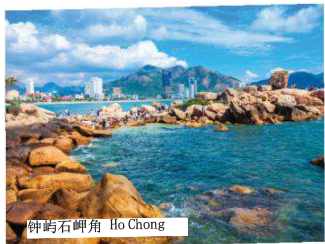
钟屿石岬角 Ho Chong