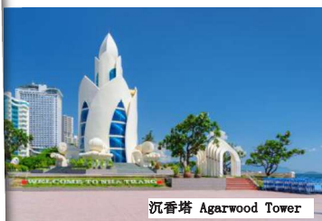
沉香塔 Agarwood Tower