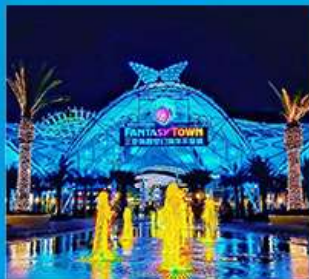
HAICHANG DREAM OCEAN NIGHT CITY