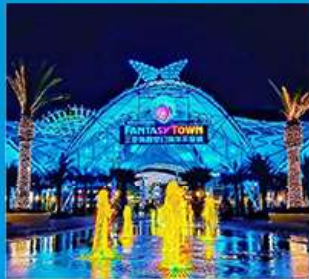
海昌梦幻不夜城 HAICHANG DREAM OCEAN NIGHT CITY