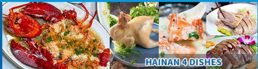
HAINAN 4 DISHES

HAINAN 4 DISHES NANSHAN VEGETARIAN LOBSTER & ABALONE SEAFOOD CUISINE