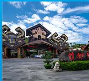
BAOTING BINGLANG VALLEY