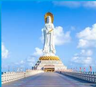
南山文化旅游区 NANSHAN CULTURAL TOURISM ZONE