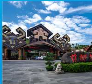
保亭槟榔谷 BAOTING BINGLANG VALLEY