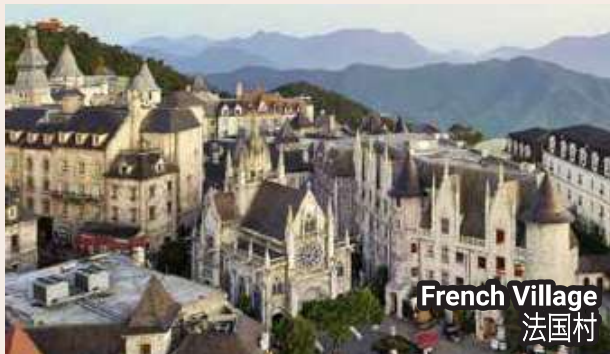
French Village 法国村