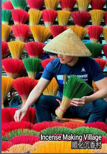
Incense Making Village 顺化沉香村