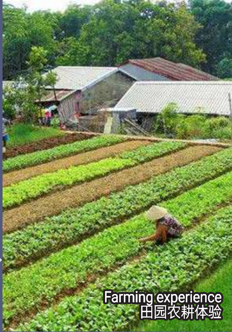
Farming experience 田园农耕体验