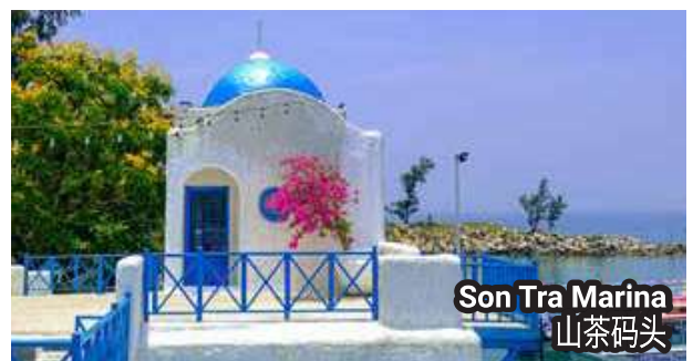
Son Tra Marina 山茶码头