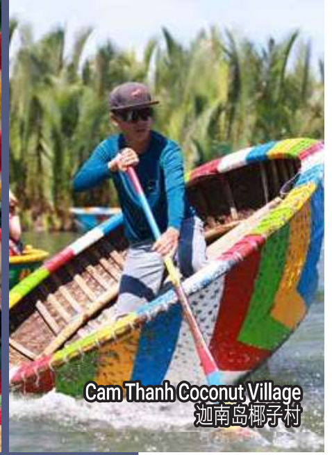
Cam Thanh Coconut Village 迦南岛椰子村