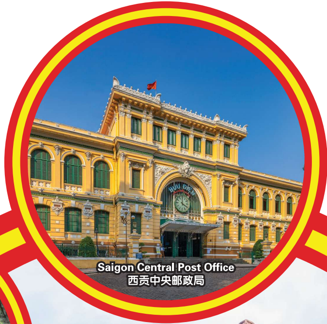
Saigon Central Post Office 西贡中央邮政局