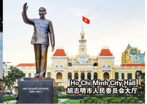
Ho Chi Minh City Hall 胡志明市人民委员会大厅