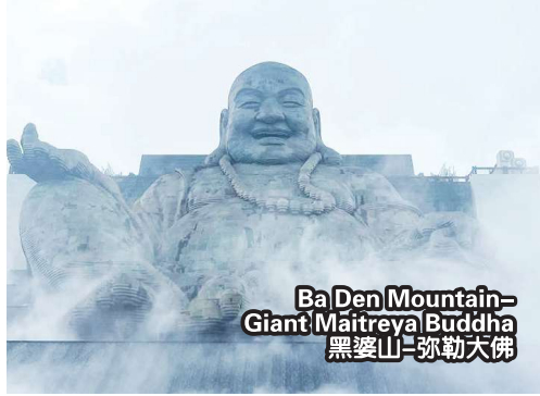
Ba Den Mountain- Giant Maitreya Buddha 黑婆山-弥勒大佛