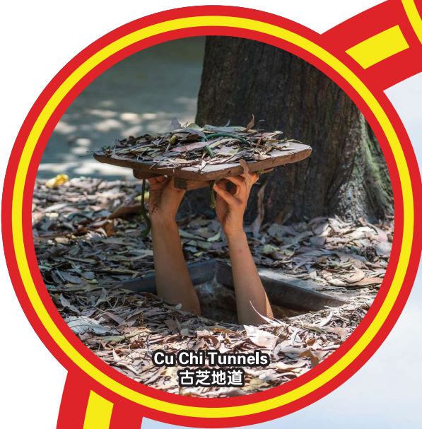
Cu Chi Tunnels 古芝地道