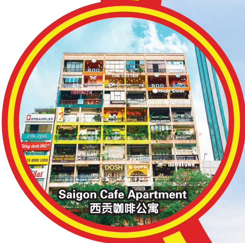
Saigon Cafe Apartment 西贡咖啡公寓