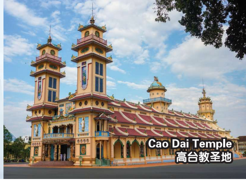
Cao Dai Temple 高台教圣地