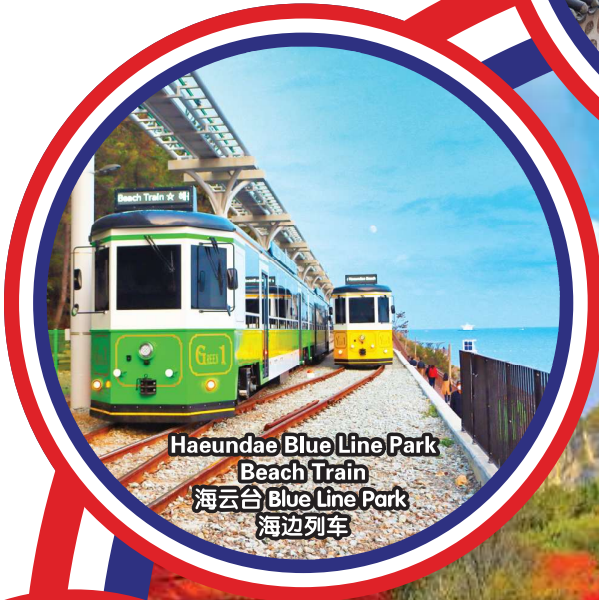
Haeundae Blue Line Park Beach Train 海云台 Blue Line Park 海边列车