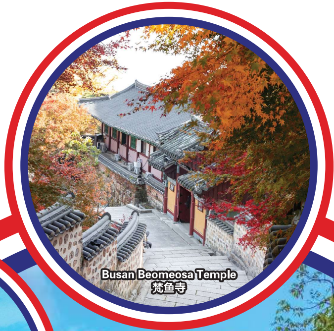
Busan Beomeosa Temple 菴鱼寺