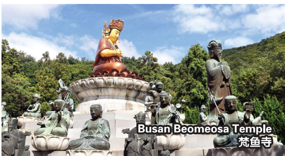
Busan Beomeosa Temple 梵鱼寺