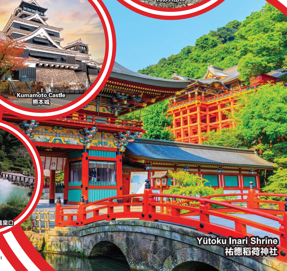
Yütoku Inari Shrine 祐徳稻荷神社

行程次序，以当地旅社安排为准。 Sequences of Itinerary are subject to local arrangement.