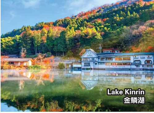
Lake Kinrin 金鱗湖