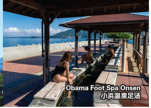
Obama Foot Spa Onsen 小浜温泉足湯