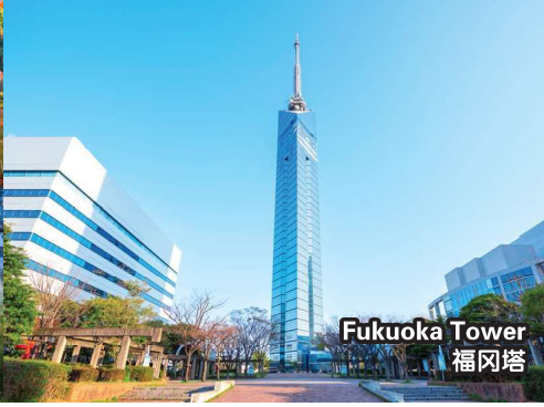
Fukuoka Tower 福岡塔