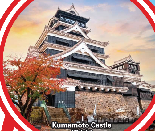
Kumamoto Castle 熊本城