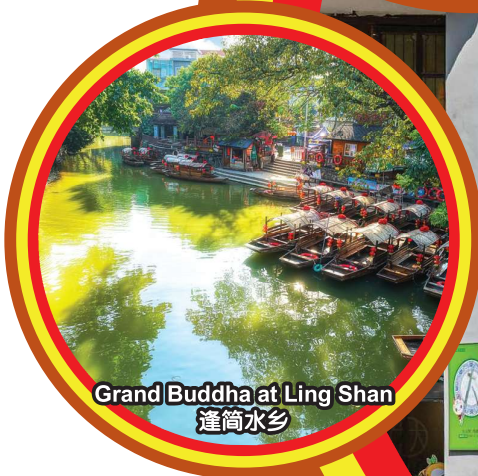
Grand Buddha at Ling Shan 逢简水乡