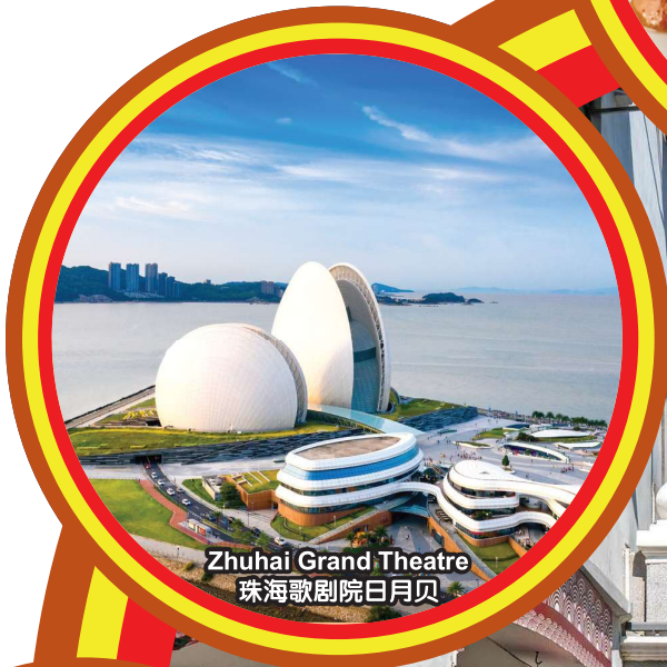
Zhuhai Grand Theatre 珠海歌剧院日月贝