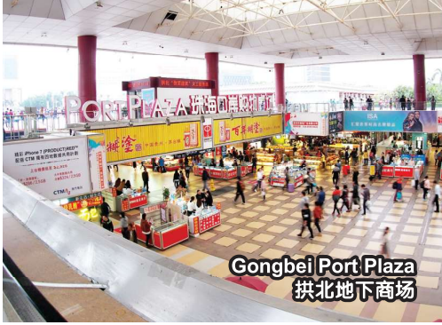
Gongbei Port Plaza 拱北地下商场