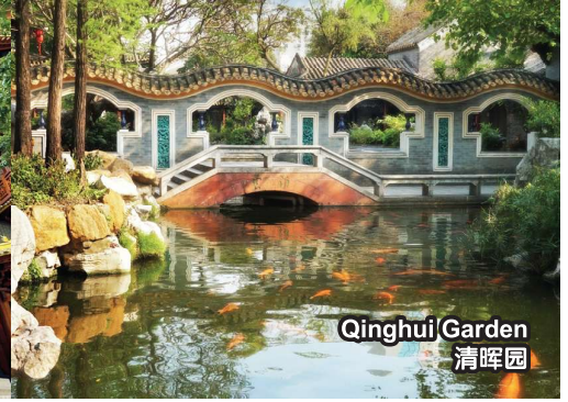
Qinghui Garden 清晖园