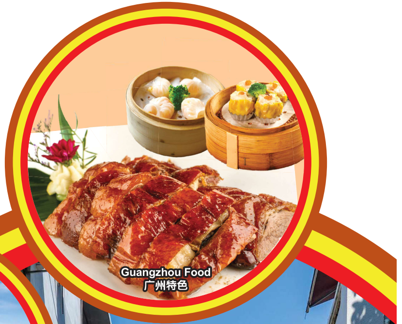
Guangzhou Food 广州特色