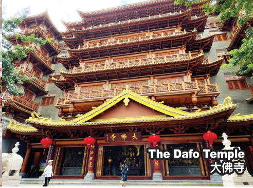
The Dafo Temple 大佛寺