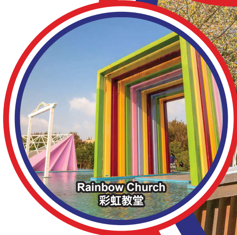
Rainbow Church 彩虹教堂