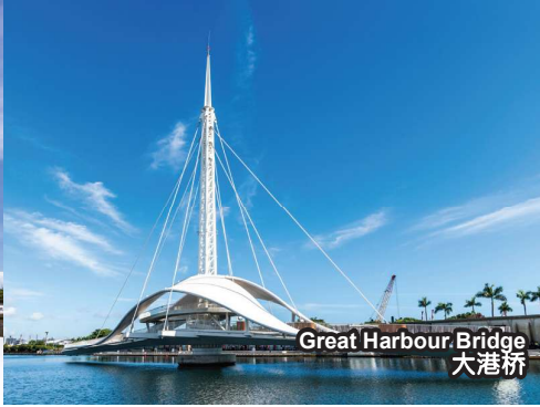
Great Harbour Bridge 大港桥