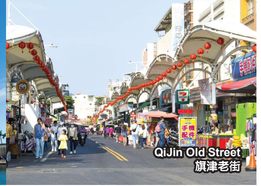
QiJin Old Street 旗津老街