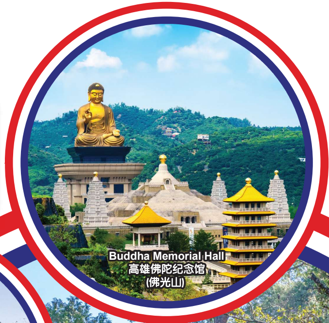
Buddha Memorial Hall 高雄佛陀纪念馆 (佛光山)