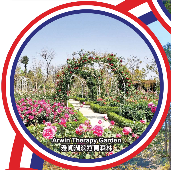
Arwin Therapy Garden 雅闻湖滨疗愈森林