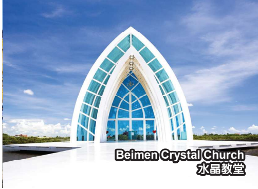
Beimen Crystal Church 水晶教堂