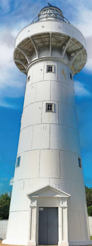
Eluanbi Lighthouse 垦丁鹅銮鼻灯塔

行程次序，以当地旅社安排为准。 Sequences of Itinerary are subject to local arrangement.