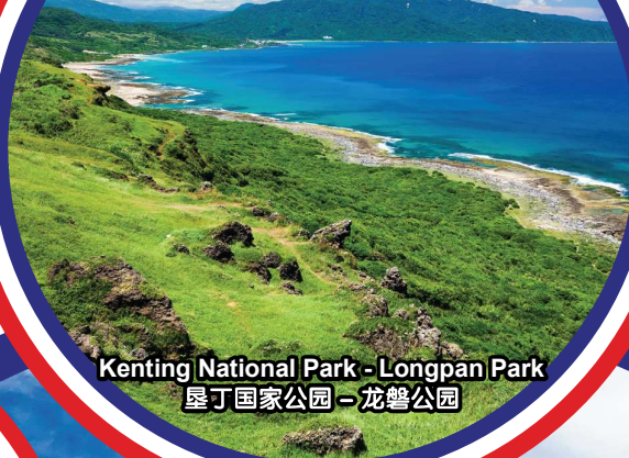
Kenting National Park - Longpan Park 垦丁国家公园 - 龙磐公园