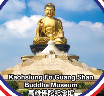
Kaohsiung Fo Guang Shan Buddha Museum 高雄佛陀纪念馆