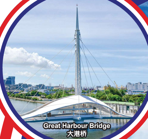
Great Harbour Bridge 大港桥