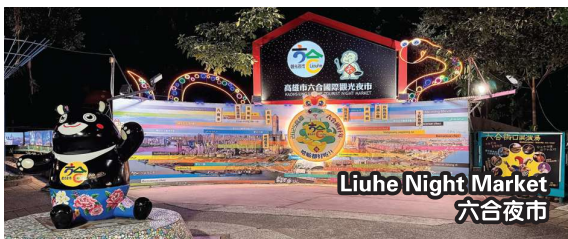
Liuhe Night Market 六合夜市

Disclaimer: Golden Destinations reserved the right to alter the sequence or change, amend or alter the itinerary if necessary, with or without prior notice. Remark: There will be no refund or replacement if the tour logistic affected by the above issue. All pictures are for illustration purpose only.