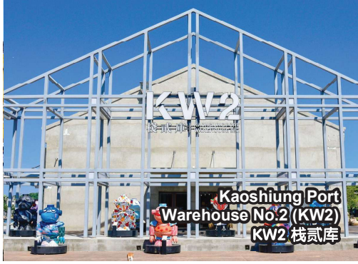
Kaoshiung Port Warehouse No.2 (KW2) KW2 棧貳庫