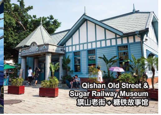
Qishan Old Street & Sugar Railway Museum 旗山老街 + 糖铁故事馆