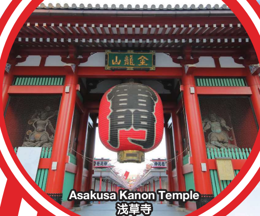
Asakusa Kannon Temple 浅草寺