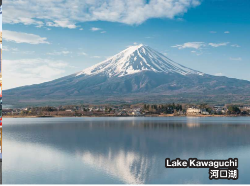
Lake Kawaguchi 河口湖