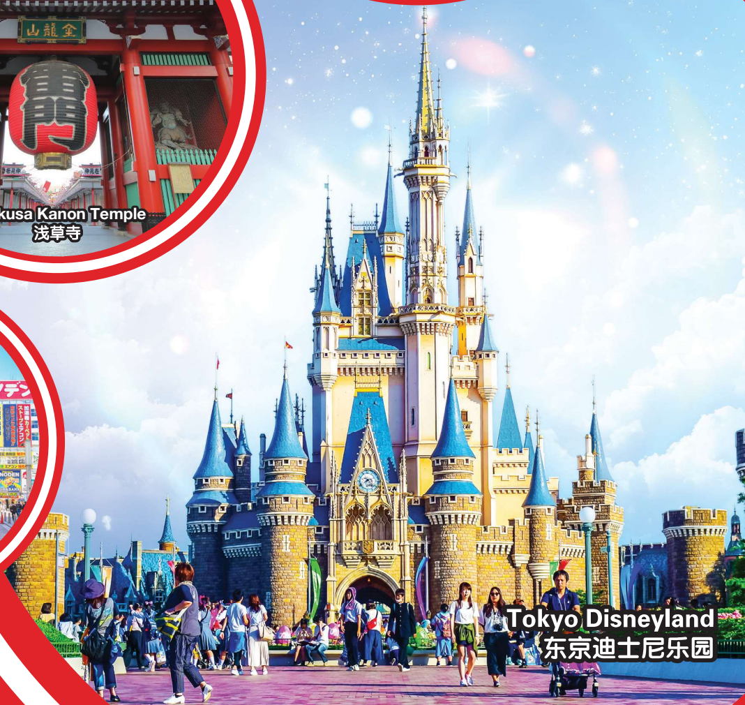
Tokyo Disneyland 东京迪士尼乐园

Sequences of Itinerary are subject to local arrangement.