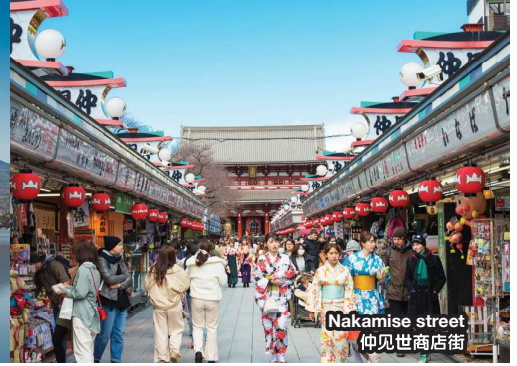
Nakamise street 仲見世商店街