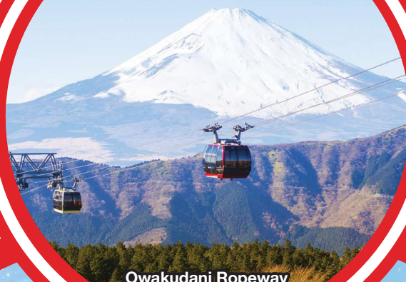
Owakudani Ropeway 箱根空中缆车

*Pictures shown are for illustration purposes only *图片仅供参考