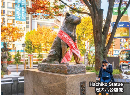
Hachiko Statue 忠犬八公像