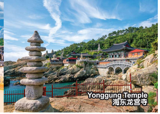
Yonggung Temple 海东龙宫寺