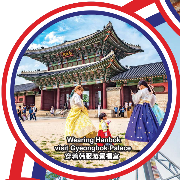
Wearing Hanbok visit Gyeongbok Palace 穿着韩服游景福宫