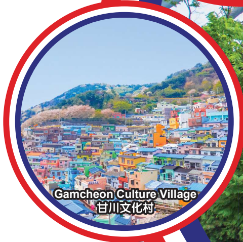
Gamcheon Culture Village 甘川文化村