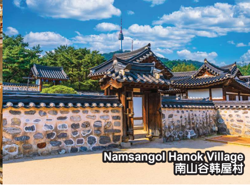
Namsangol Hanok Village 南山谷韩屋村