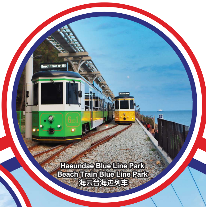
Haeundae Blue Line Park Beach Train Blue Line Park 海云台海边列车