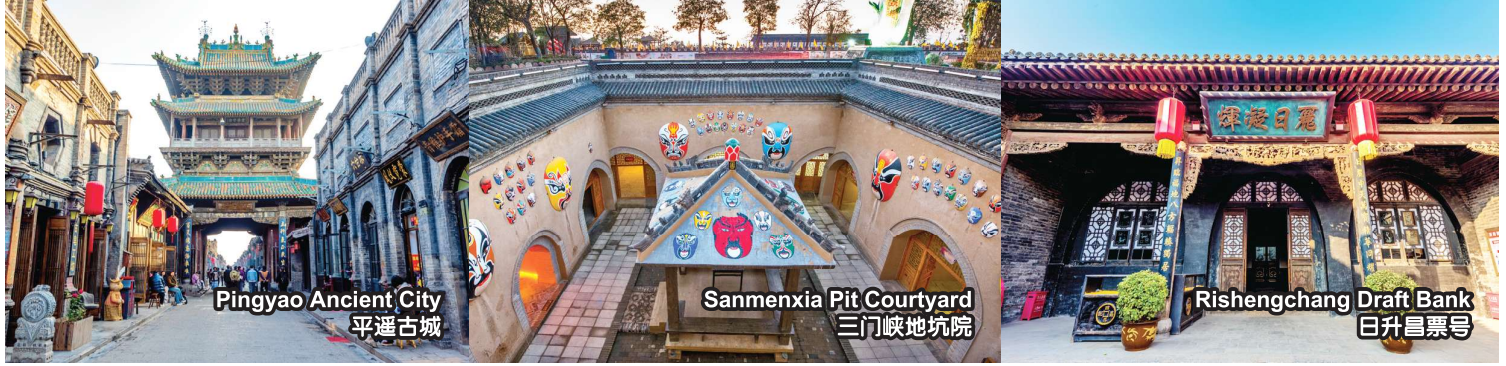
Pingyao Ancient City 平遥古城