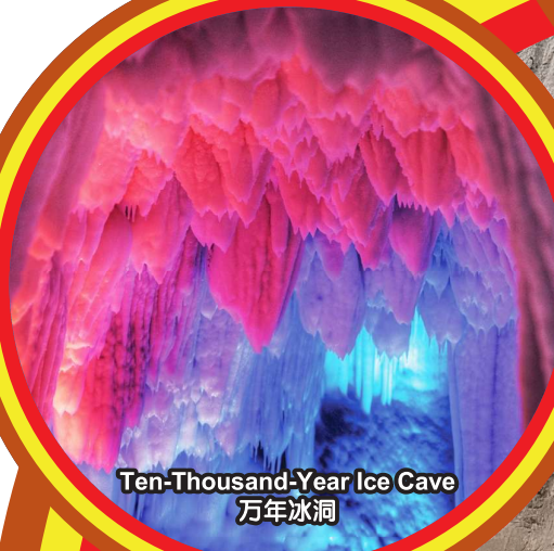
Ten-Thousand-Year Ice Cave 万年冰洞