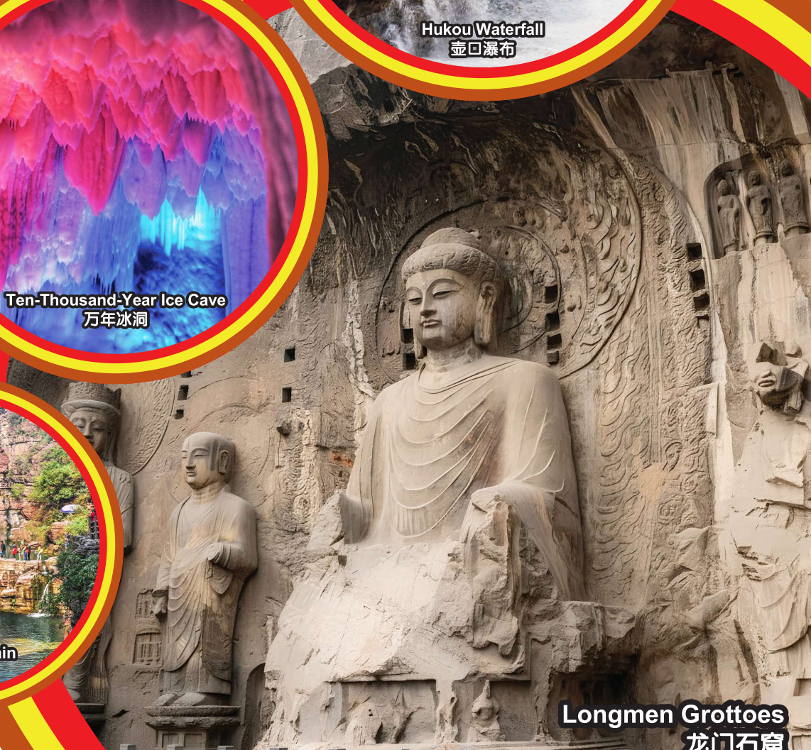
Longmen Grottoes 龙门石窟

行程次序, 以当地旅社安排为准。 Sequences of Itinerary are subject to local arrangement.