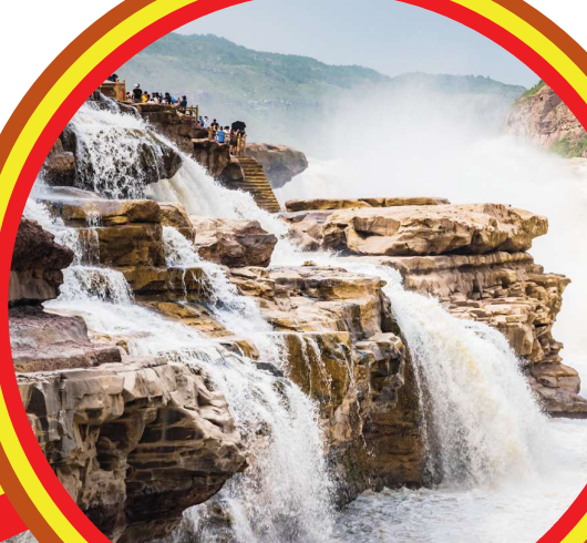
Hukou Waterfall 壶口瀑布