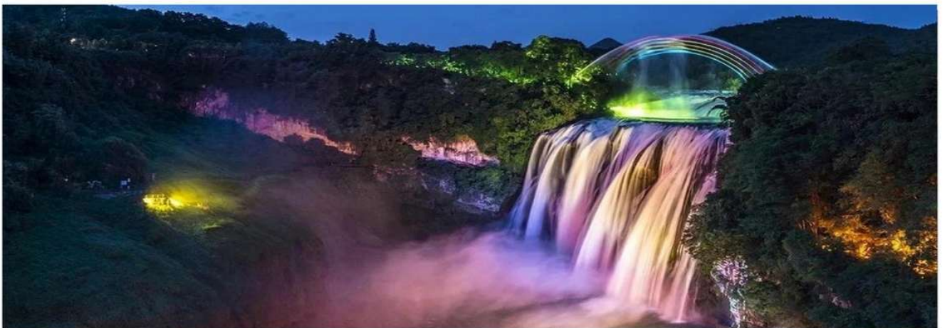
▲ 黄果树大瀑布 Huangguoshu Waterfall