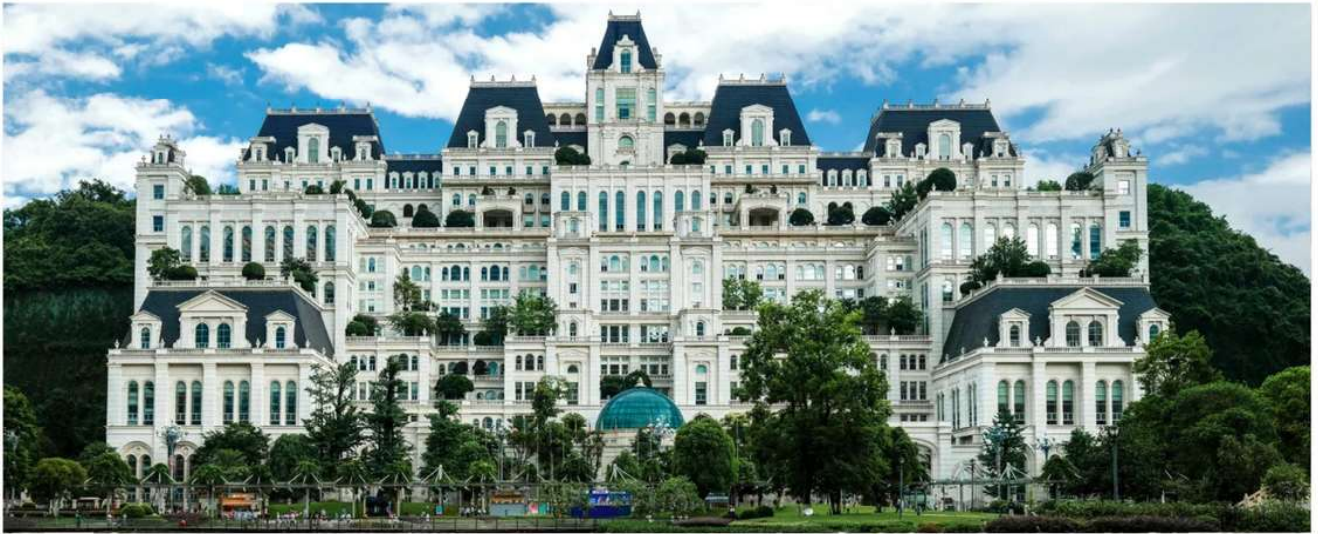
▲ 白宫 GUIYANG WHITE HOUSE