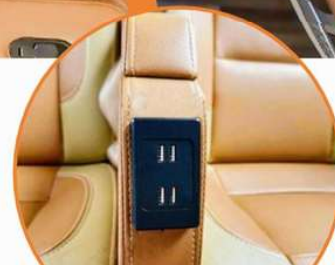
USB充电接口 USB charging interface

Large space sofa seat is more comfortable; the car is equipped with USB charging interface, and the power is not cut off during the journey.