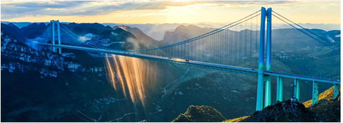
▲ 花江峡谷大桥 Huajiang Gorge Bridge