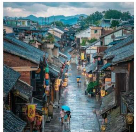
▲ 青岩古镇 Qingyan Ancient Town