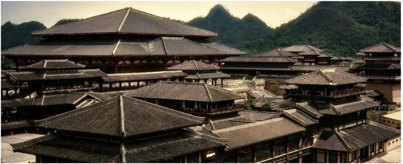
▲ 秦汉影视城 Qinhan Film City