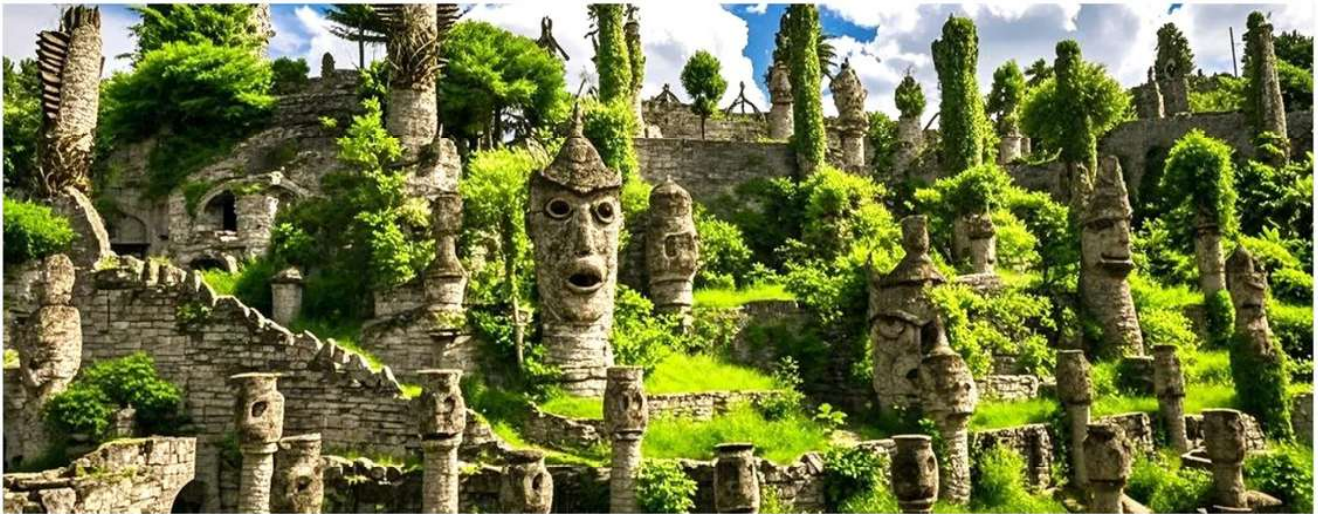
▲ 夜郎谷 YELANG VALLEY