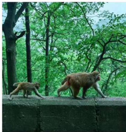
▲ 黔灵山公园 Qianling Mountain Park