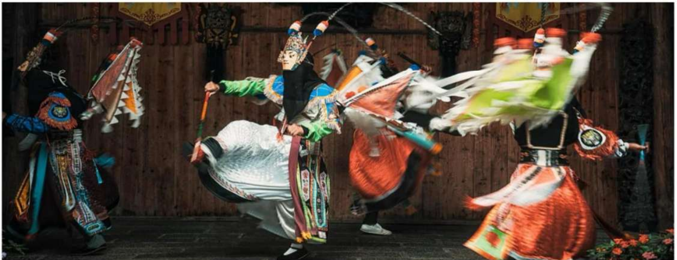
▲ 天龙屯堡 Tianlong Tunpu