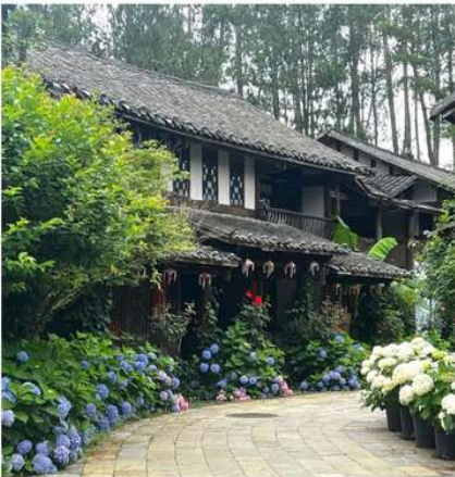
▲ 格鲁格桑十八寨 Gelugesang Eighteen Villages