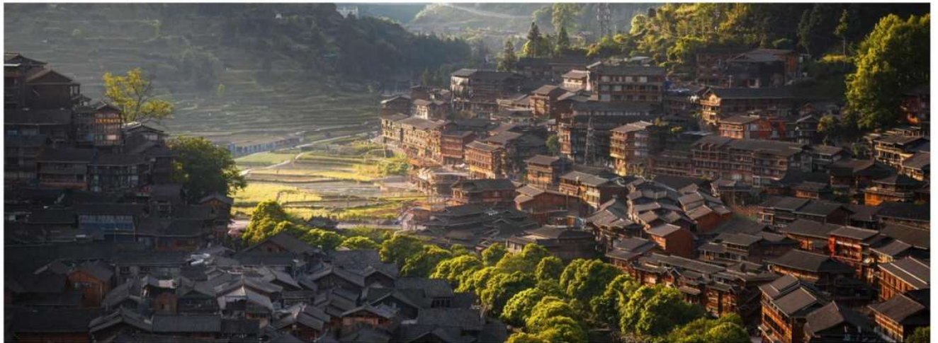
▲ 西江千户苗寨 Xijiang Thousand-House Miao Village