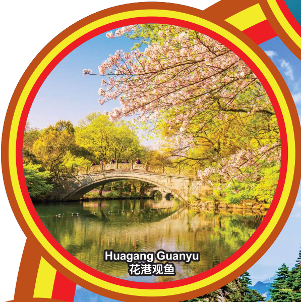
Huagang Guanyu 花港观鱼