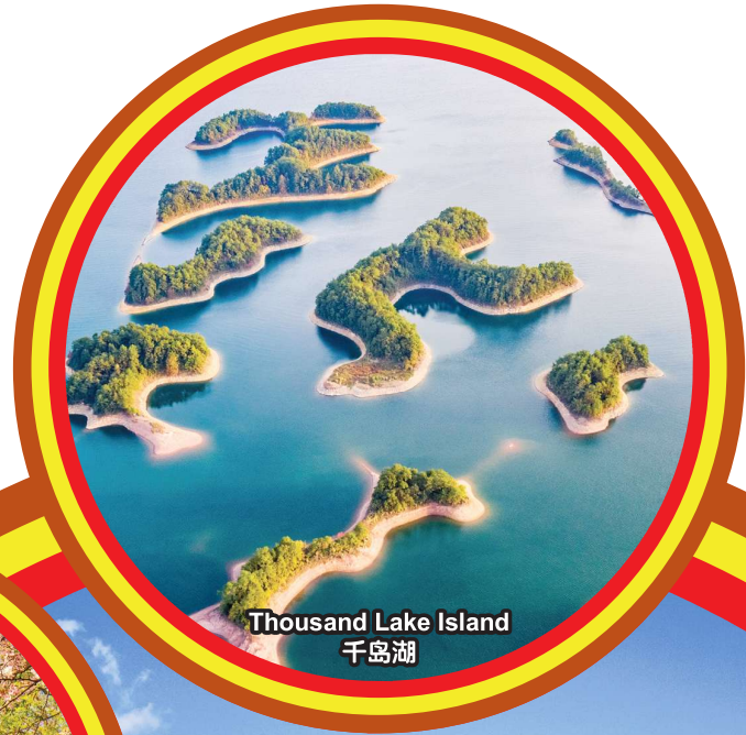
Thousand Lake Island 千岛湖