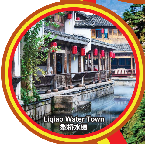
Liqiao Water Town 梨桥水镇