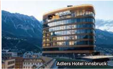
Adlers Hotel Innsbruck