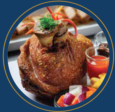
Austria Pork Knuckle 奥地利猪肘