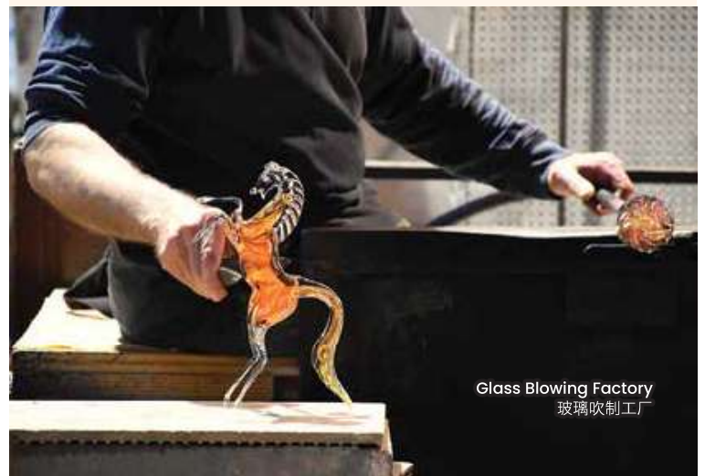
Glass Blowing Factory 玻璃吹制工厂

Sequences of itinerary are subject to local arrangement. Itineraries, meals, hotels and transportation are subject to change without prior notice.