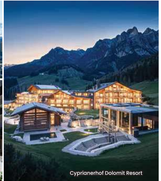
Cyprienerhof Dolomites Resort