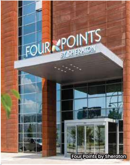
Four Points by Sheraton

Embark on a complete journey at 4+5-star hotel, offering a quality & comfortable stay. 全程安排四+五星级酒店, 让您在整个旅程中享受到有质量且舒适的住宿环境。