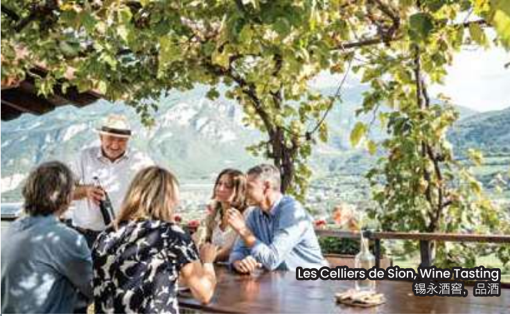
Les Celliers de Sion, Wine Tasting 锡永酒窖, 品酒