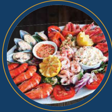
Seafood Platter 海鲜拼盘