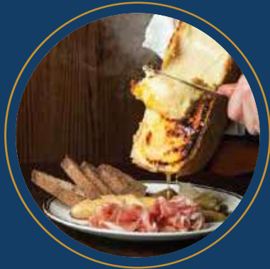
Raclette Cheese 瑞士特色烤奶酪