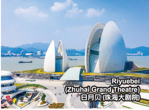
Riyuebei (Zhuhai Grand Theatre) 日月贝(珠海大剧院)