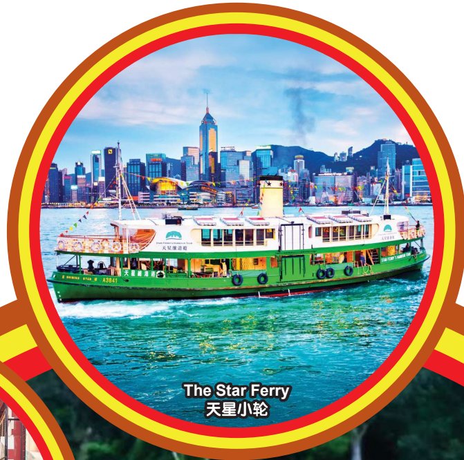
The Star Ferry 天星小轮