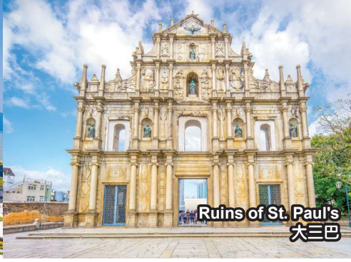
Ruins of St. Paul's 大三巴