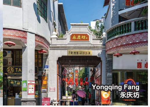
Yongqing Fang 永庆坊