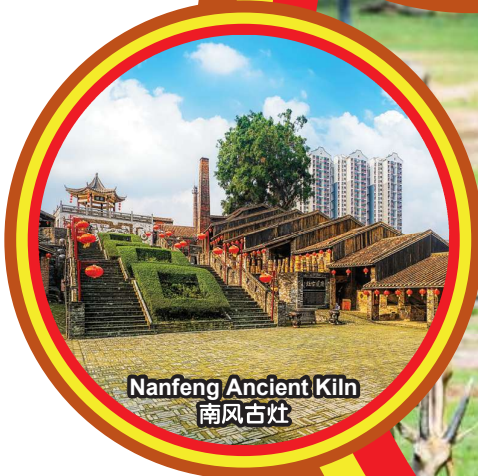
Nanfeng Ancient Kiln 南风古灶