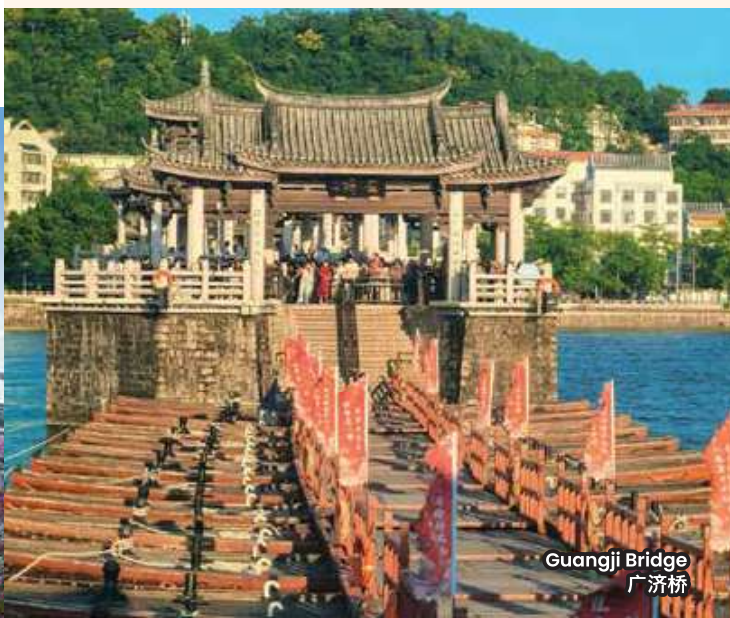
Guangji Bridge 广济桥