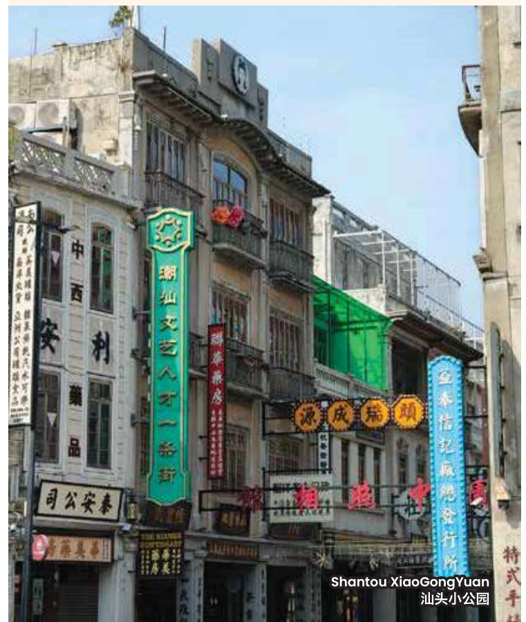
Shantou XiaoGongYuan 汕头小公园