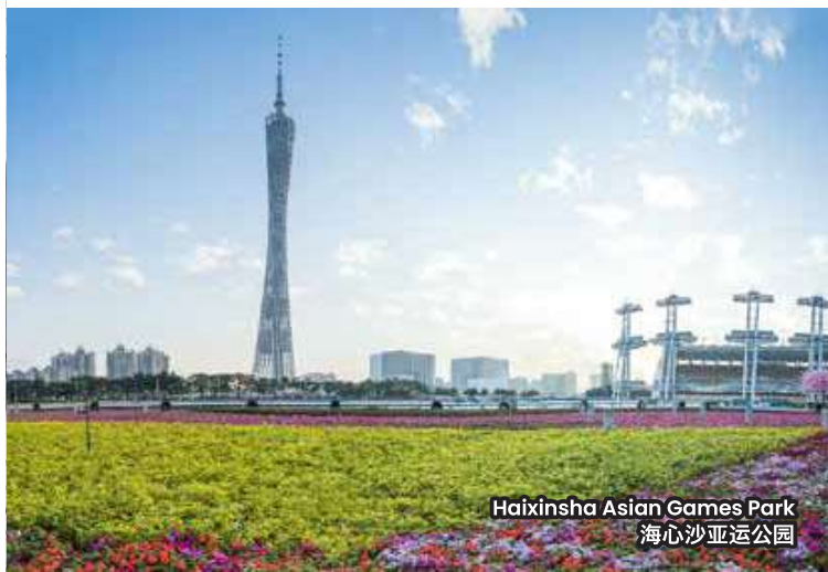
Haixinsha Asian Games Park 海心沙亚运公园

行程次序以当地旅行社安排为准。行程，膳食，住宿，交通等可能会因不可抗拒因素而更动，恕不另行通知。