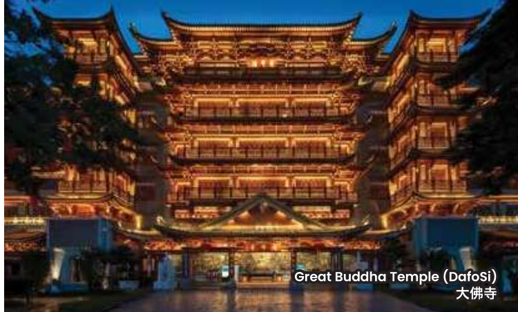
Great Buddha Temple (Dafosi) 大佛寺